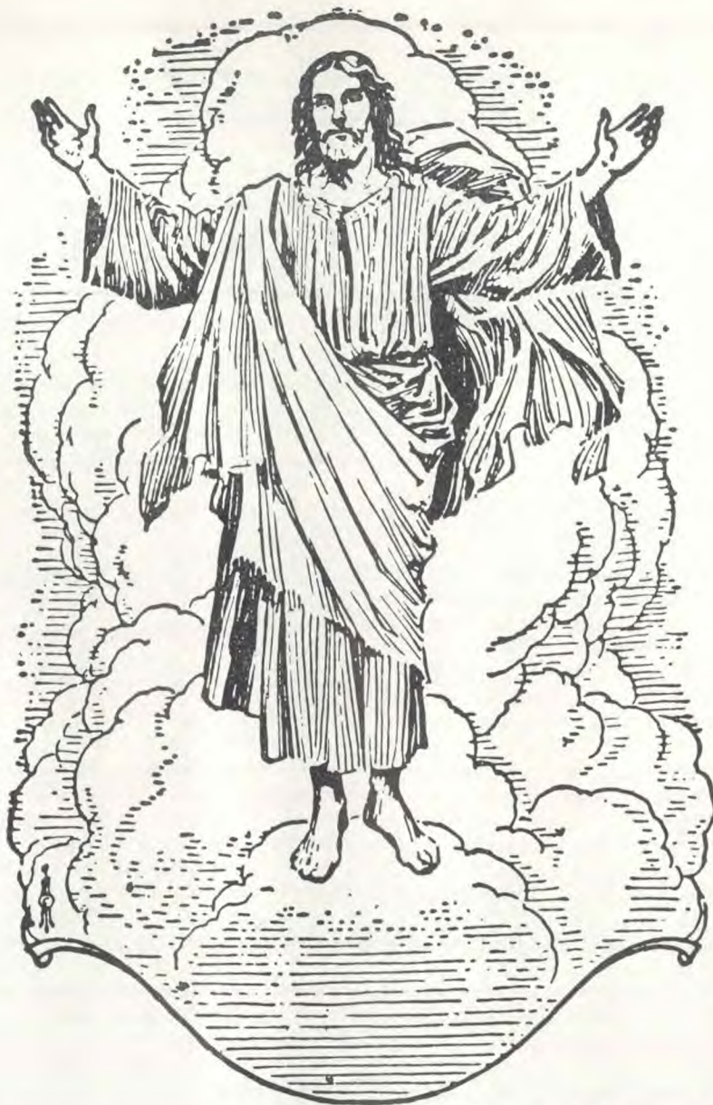
The most important event of the future is not the development of atomic power, or even the next war, but the second coming of Christ from heaven in power and great glory. It is the hope of all ages.

13. And how wonderful will be the scene as the Saviour leaves heaven, attended by the radiant glory of all the angelic host, a wondrous diadem of exceeding beauty and glory resting upon His sacred brow, His countenance outshining the dazzling brightness of the noonday sun, and His vesture flashing forth His mighty name, "KING OF KINGS, AND LORD OF LORDS." Revelation 19:16.