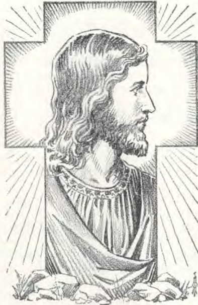
Temptations may be resisted successfully only through the mighty power of the Man of the Cross.