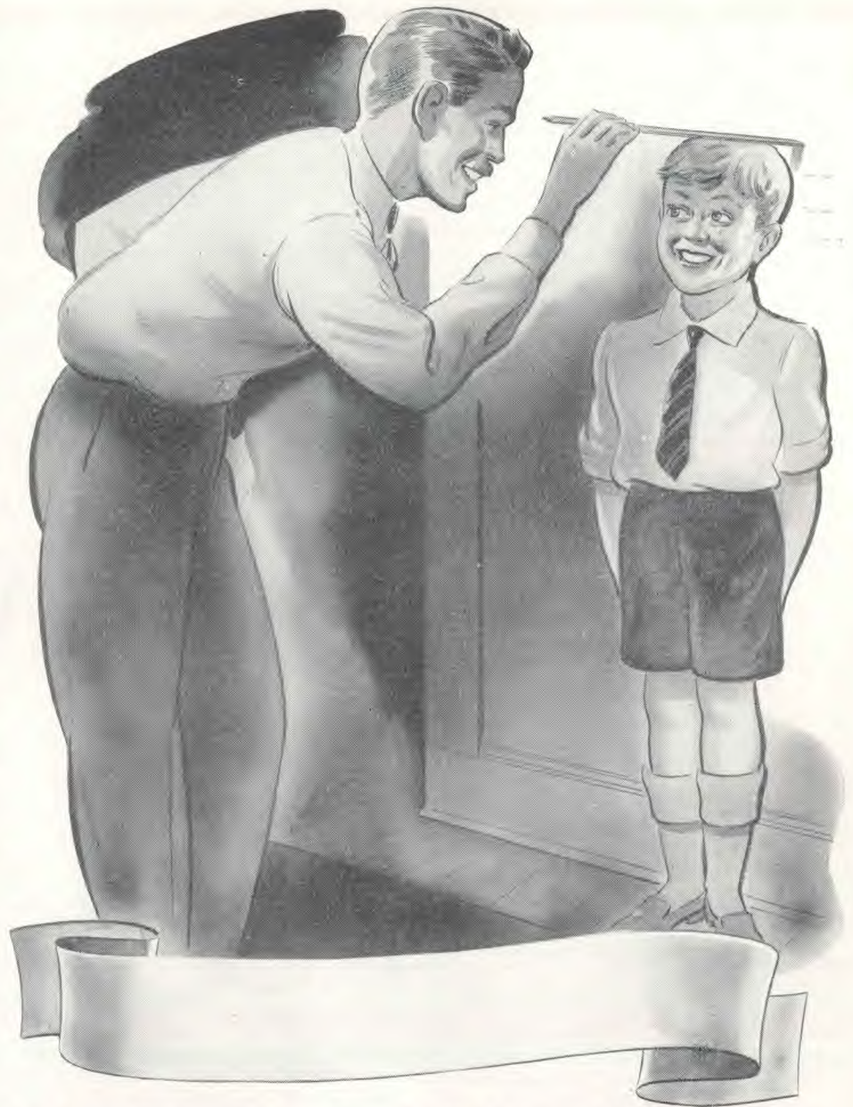
Any day may be measuring day at home, but God has appointed a "day" of judgment, and His law, the ten commandments, is the standard.

John, the beloved disciple, says, "Whosoever committeth sin transgresseth also the law: for sin is the transgression of the law." "He that saith, I know Him, and keepeth not His commandments, is a liar, and the