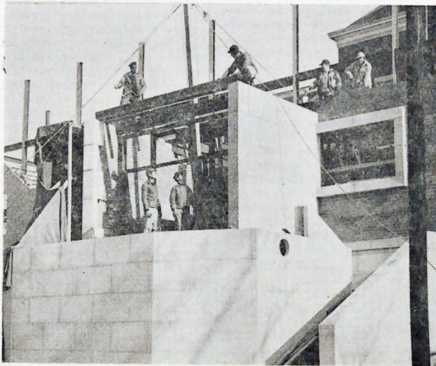
The stonework for the front entrance nears completion as brick walls and steel girders rise on new dorm.

The windows for the second floor of the new men's dormitory will be put in before the end of January. According to the schedule, they should be in place by January 15. The concrete for the second floor ceiling will be poured afterwards as soon as possible in order to seal out the weather. When this is done, the workmen can do their work more comfortably, and the building and materials will be protected from the ice.