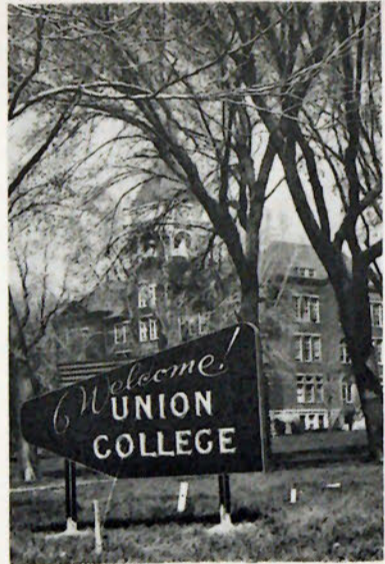
The '55 senior class gift is temporarily supported by cables and wooden pegs while concrete sets around metal legs.

The senior class of 1955 is presenting to Union College two lighted "welcome" signs as the senior gift.