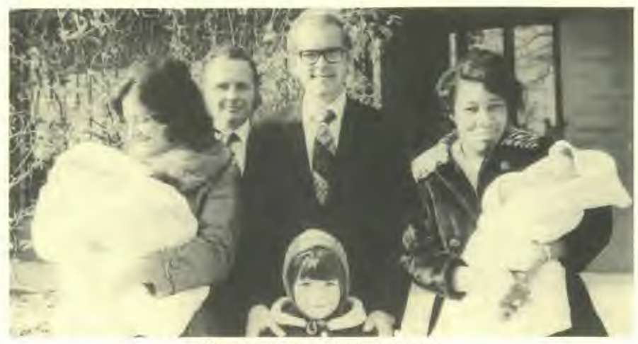
Mississauga Church Child Dedication.

Please pray for the continued advancement in the work at Mississauga. The great need now is for a church home and a church school facility for this city of over 200,000.