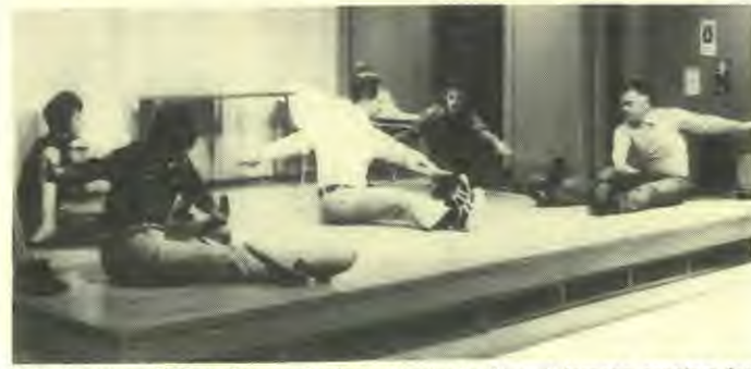
Exercise time. This helps me to keep the body fit and lessens craving for nicotine.