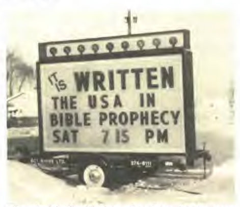
The electrically lit sign advertising the lectures.

phasized by a huge electrically lit sign placed near a busy thoroughfare near the church, and people read the subject of each evening's lecture as they drove by. This proved effective, and people came after reading the sign.