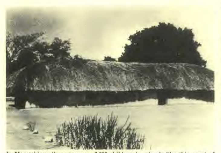
In Mozambique there are over 6,000 children in schools like this, most of them taught by teachers with only four years of formal education. Where can the teachers go to upgrade their preparation? Where will the students study after their first years of primary school? Your offering this 13th Sabbath will help to build the SDA Educational Center in Mozambique and give them an opportunity to prepare for service in God's Cause.

We look to you, dear Sabbath School members around the world. We are confident that through you God will answer our prayers. These are serious times in Mozambique. We cannot count on tomorrow, but if we have well-prepared Mozambique workers, all will be well. Then there will be a church ready for the Master's return in this corner of the southeast Africa.