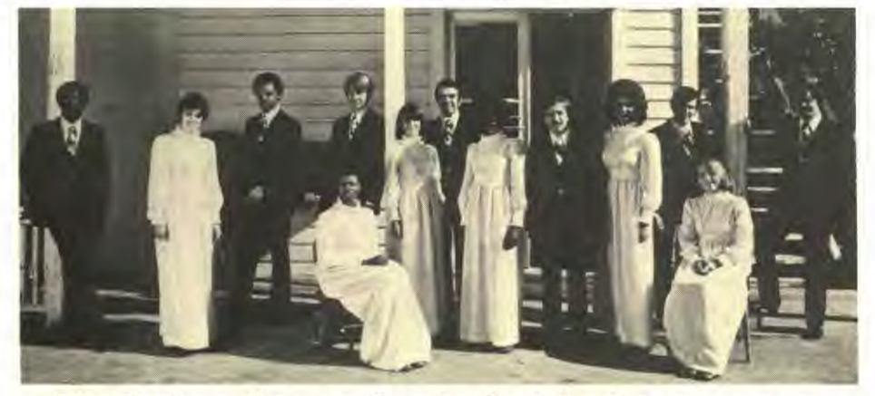
The Heritage Singers will make the following appearances:

May 21, 7:30 p.m. Ottawa S.D.A. Church 2200 Benjamin St., Ottawa