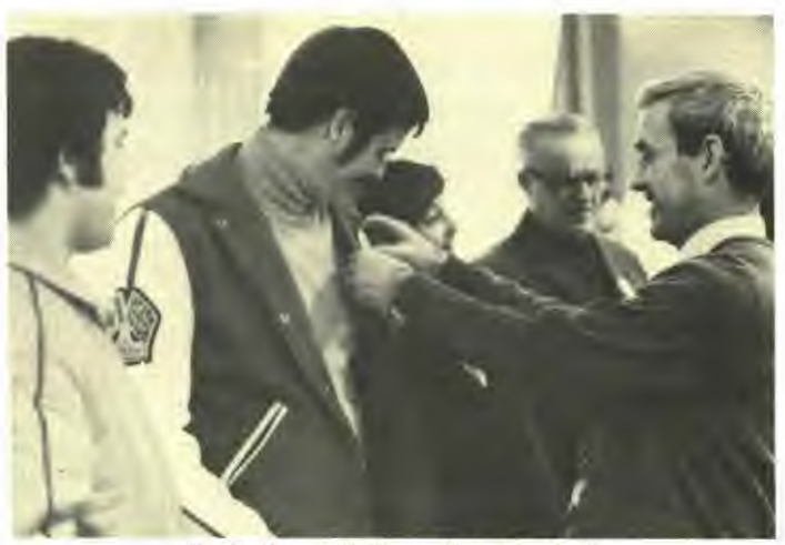
Graduation - "I Choose Not to Smoke."

The first follow-up program held February 10 brought back 20 participants. A team from Counterweight, formerly Weight Watchers of Ontario, led the discussion. Knowing the struggle against craving, they could well sympathize with the cigarette quitters and upheld the tremendous power of the will and the value of the buddy-system in this battle. Most of the folk present had been off cigarettes since the start of the Plan. And, they all received a big hand of deserving applause for their great achievement. Let's all pray that they keep it up with the help of God.