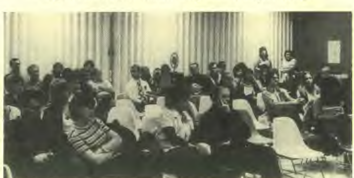
"I'm not so sure about all this, but let's push toward victory."