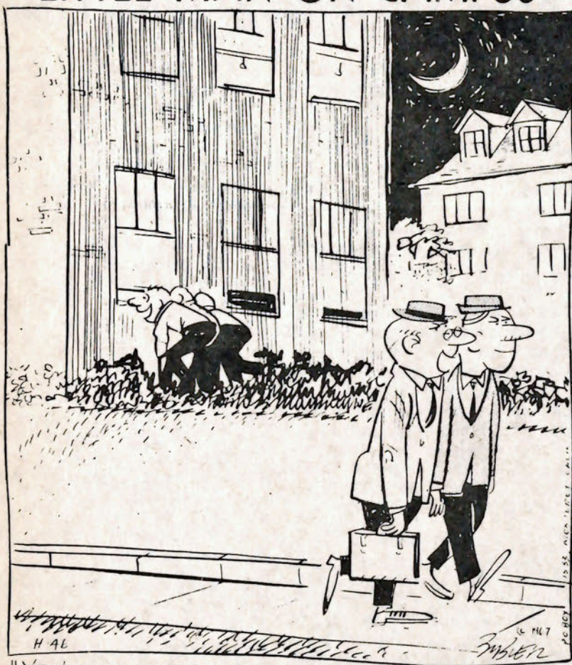
YOU'LL FIND THIS A PLEASANT CAMPUS -WITH YOUNG EAGER INQUIRING MINDS."