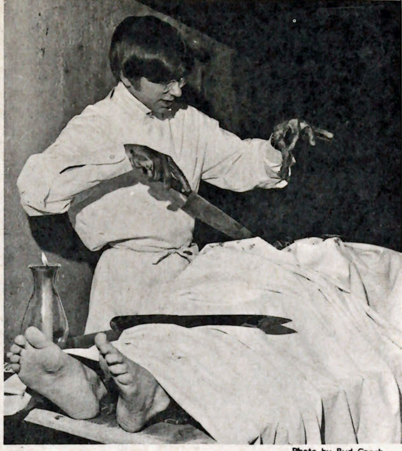
Operation Macabre being conducted by Doctor Death.

Gruesome wonders were seen during the steam tunnel tour as part of the ASB Halloween party.