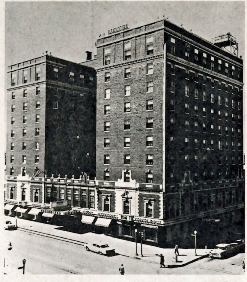
The Cornhusker Hotel will be the scene of the ASB Potpourri on Sunday, Novem-

The NASM standards by which the music department is evaluated include objectives of the department, instructional programs and procedures, curriculum faculty, library facilities and service, physical plant and equipment, finances and results of teaching. Full NASM membership includes periodic re-evaluation of the department in all of these areas.