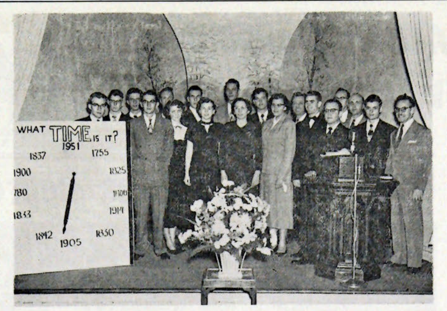
What time is it? M.V. program given Friday night, October 26. See story on page 1.

In my quiet room I talked with the Friend I love, As He engineered His planets, His stars, His suns; My little world was what I was dreaming of, My little day, and my own near, precious ones. And He with hands on the universe, His eyes Upon endless space and the sweep of eternity, Bent above me, listening to my cries, And, forgetting my faults and failures, answered me. -Anonymous