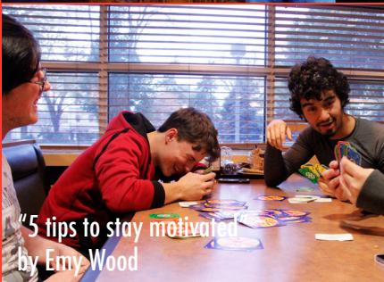
"5 tips to stay motivated" by Emy Wood

In this week's online issue, check out the latest news on smartwatches, discover ways you can make peace your way of life, and find out how you can help the homeless in Lincoln.