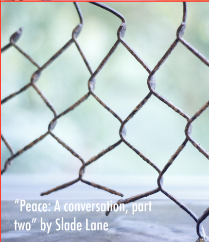
"Peace: A conversation, part two" by Slade Lane