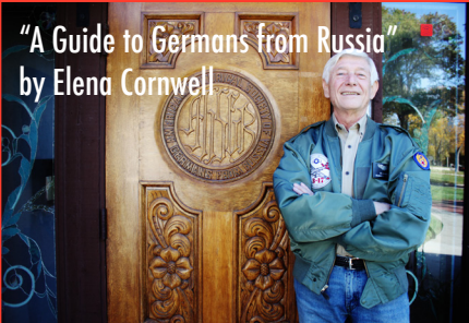
"A Guide to Germans from Russia" by Elena Cornwell

In this week's online issue, check out the latest news on smartwatches, discover ways you can make peace your way of life, and find out how you can help the homeless in Lincoln.