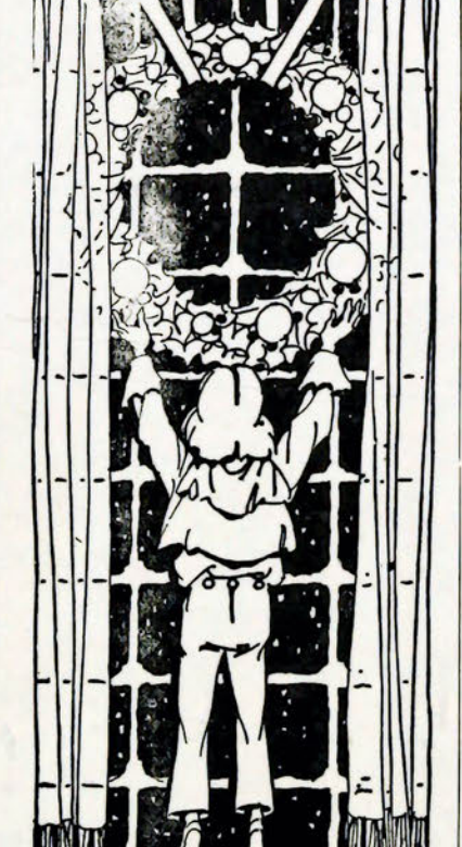
December 16, 1940