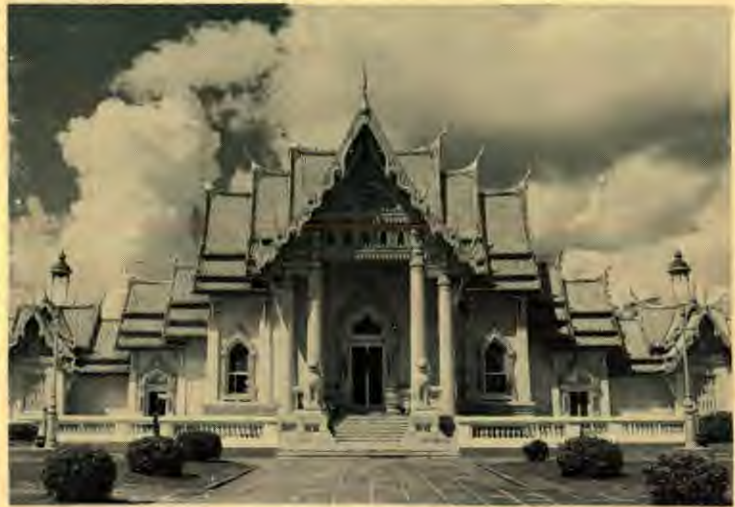
One of the many picturesque temples in Thailand.

Majesty the King of Thailand. At 9:30 a.m. we were entering the guarded gate to the Chitalda Palace where the king lives. We were ushered past white starched-uniformed police guards to the royal pavilion. Here we were to wait for His Majesty.