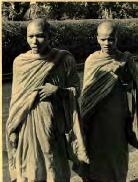
Orange-robed Buddhist priests in Thailand.

that would ensure him of a long and happy life—yes, eternal life and happiness? I bowed before His Majesty and took a few paces toward him, then I presented on a golden plate the gift to him and said, "With great joy we present to His Majesty the best gift—the Word of God." Graciously His Majesty accepted God's Word. As he looked upon the beautiful leather-bound Bible with his name inscribed in gold he smiled. He seemed especially pleased to receive the Word of God.