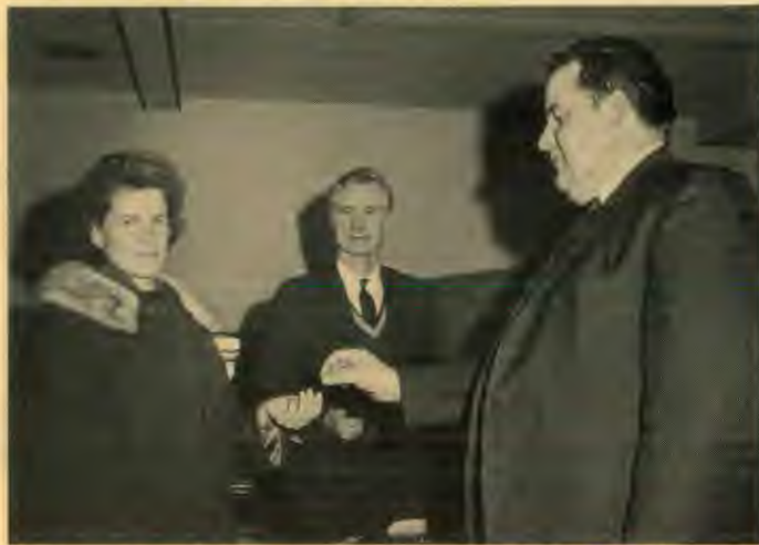
Some of the fifty to seventy-five who attended the three-day Civil Defence School.