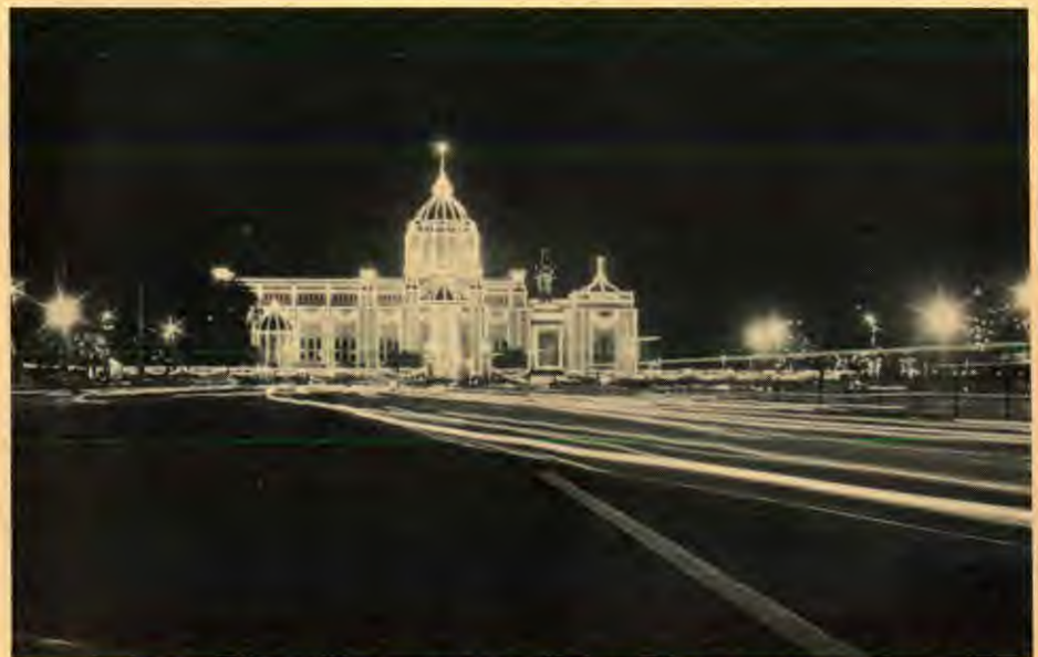
Bangkok's capital lit up with thousands of coloured lights on the eve of the King's birthday. All public buildings were lit up this way. It was more elaborate and spectacular than we see in North America at Christmas time.