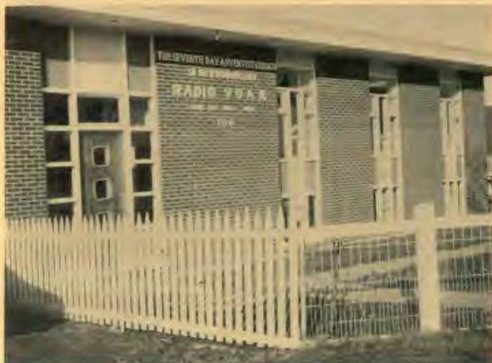
The front of the building facing Freshwater Road showing front entrance and wing advertising the Church, Radio Station and Book and Bible House.