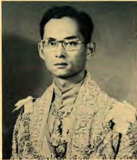
His Majesty King Bhumibol Adulyadej, King of Thailand — dedicated to his people and beloved by them.