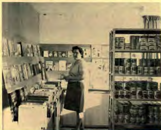
A picture of the display shelves in the Book and Bible House.