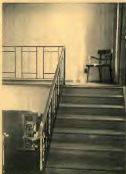
Inside entrance to the office upstairs and to the Book and Bible House downstairs.