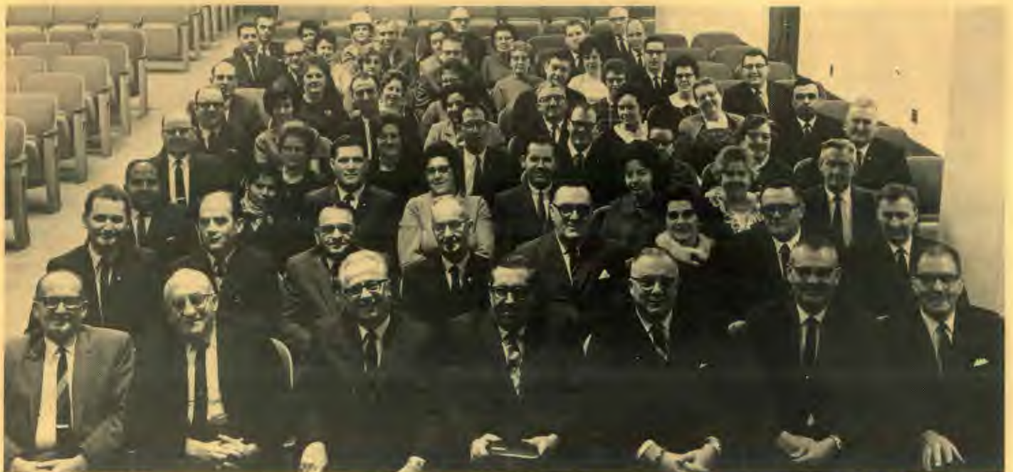
Literature Evangelists and leaders attending the annual institute in Washington, D.C. from eastern Canada. This meeting was held in the chapel of the Review & Herald Publishing Association.