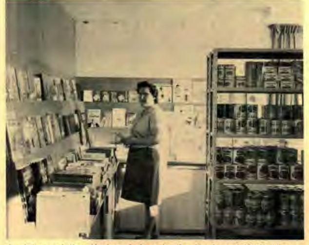
A picture of the display shelves in the Book and Bible House.

It is our prayer that this new building will serve Newfoundland to the honour and glory of the Saviour as a constant witness to the great truths that have been revealed to the Seventh-day Adventist Church.