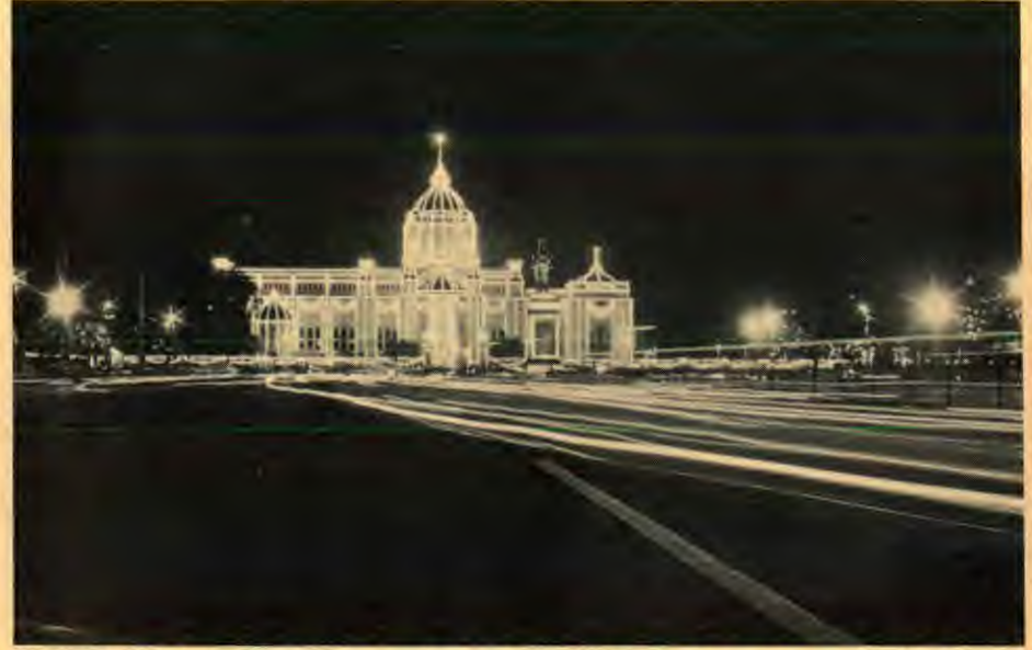
Bangkok's capital lit up with thousands of coloured lights on the eve of the King's birthday. All public buildings were lit up this way. It was more elaborate and spectacular than we see in North America at Christmas time.

that would ensure him of a long and happy life—yes, eternal life and happiness? I bowed before His Majesty and took a few paces toward him, then I presented on a golden plate the gift to him and said, "With great joy we present to His Majesty the best gift—the Word of God." Graciously His Majesty accepted God's Word. As he looked upon the beautiful leather-bound Bible with his name inscribed in gold he smiled. He seemed especially pleased to receive the Word of God.