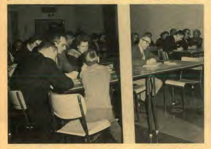
Some of the fifty to seventy-five who attended the three-day Civil Defence School.

trouble come. Take the time now and inquire from your local Civil Defence Leader and ask when a training course will be held in your area. Get involved and be ready!