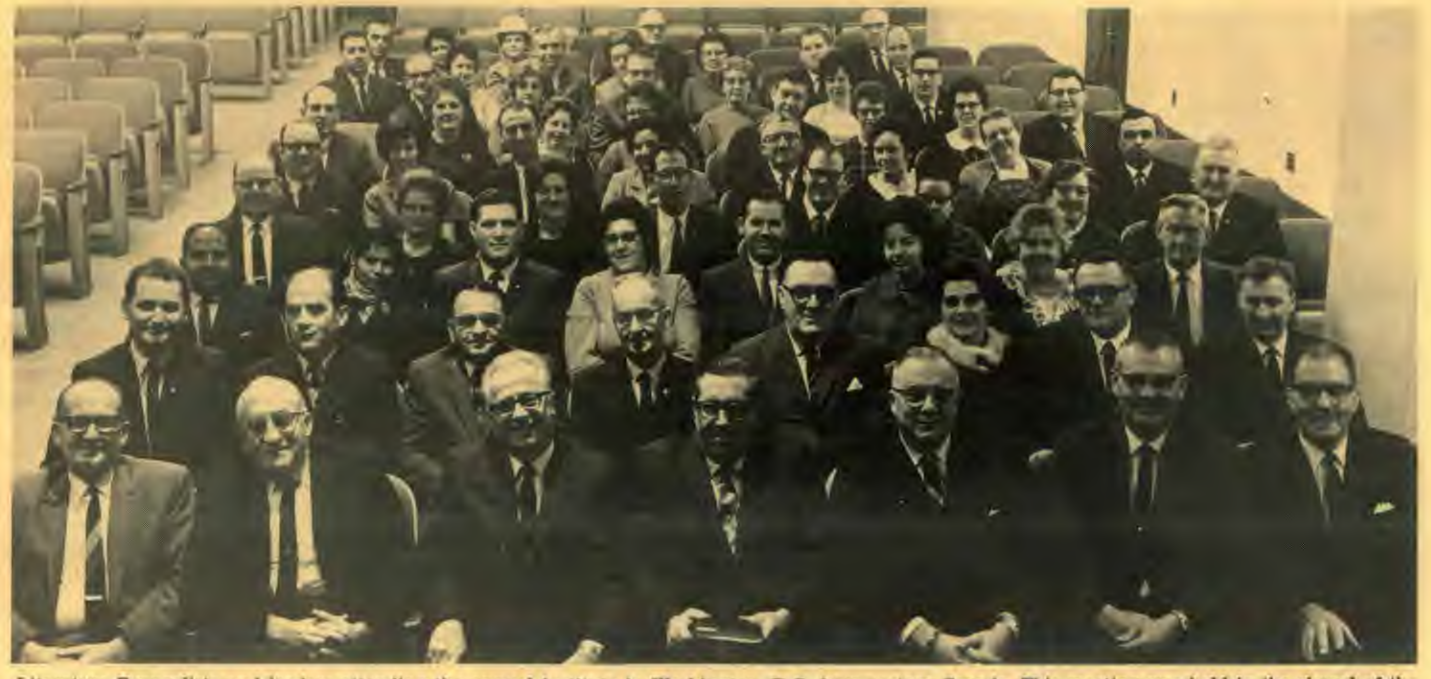
Literature Evangelists and leaders attending the annual institute in Washington, D.C. from eastern Canada. This meeting was held in the chapel of the Beview & Herald Publishing Association.