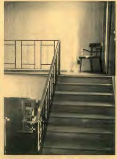
Inside entrance to the office upstairs and to the Book and Bible House downstairs.

play room there are racks displaying books, greeting cards, etc. Also there are shelves displaying the various health foods.