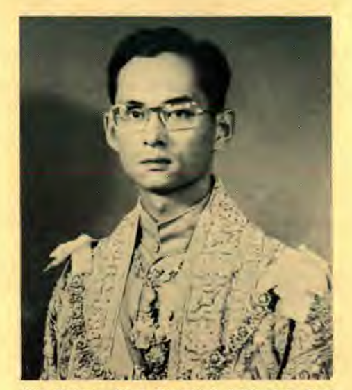
His Majesty King Bhumibol Adulyadej, King of Thailand — dedicated to his people and beloved by them.

Majesty the King of Thailand. At 9:30 a.m. we were entering the guarded gate to the Chitalda Palace where the king lives. We were ushered past white starched-uniformed police guards to the royal pavilion. Here we were to wait for His Majesty.