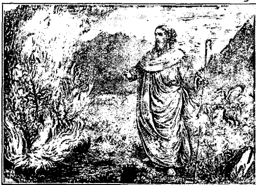
MOSES AND THE BURNING BUSH