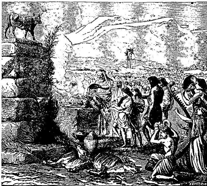
WORSHIPING THE CALF GOD, APIS