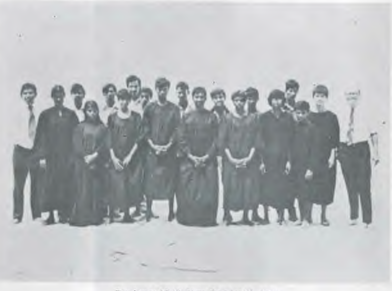
Baptism at Morib River, October 16, 1976.

The fourteen who make up the Banting group have plans that before long a church will be erected in the town of Banting. Let's join them in praying and working toward that end.