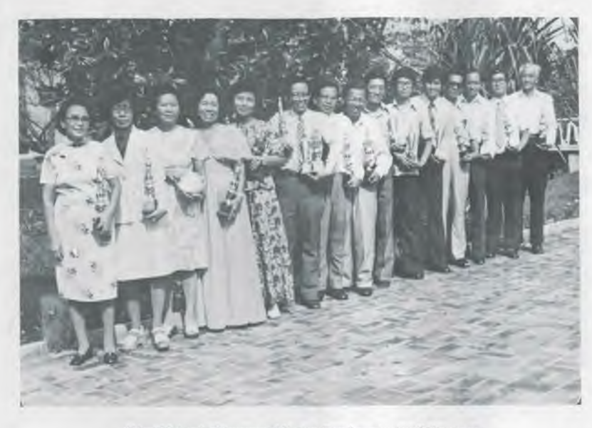
West Malaysia-Singapore Mission Trophy-winning Colporteurs.