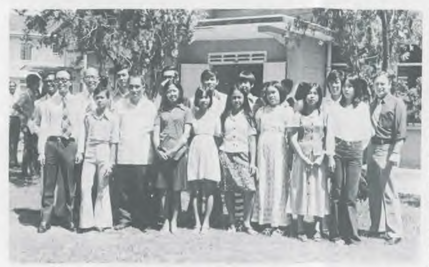
Baptismal group from the Penang Crusade.