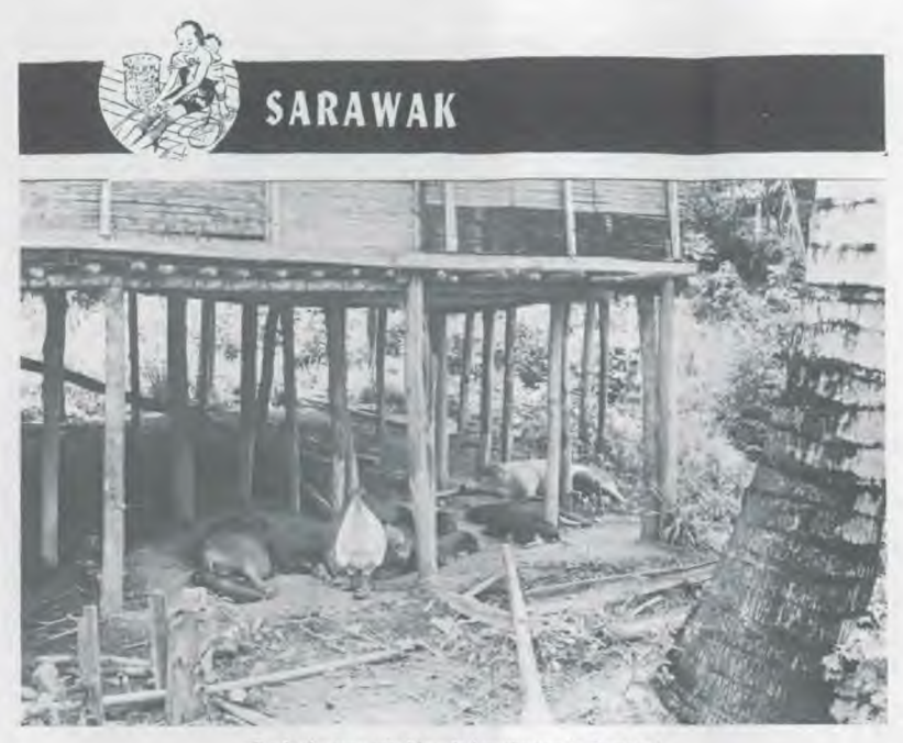
Typical scene of old style longhouse in Sarawak.