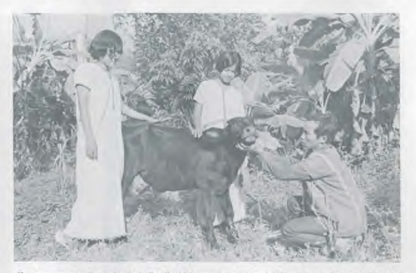
Karen young people admire the bull calf which was donated to the Karen farmers for enriching their cattle herds.

the S.D.A. members, then we want to help the non-S.D.A.'s, too, as long as they agree not to raise pigs again.