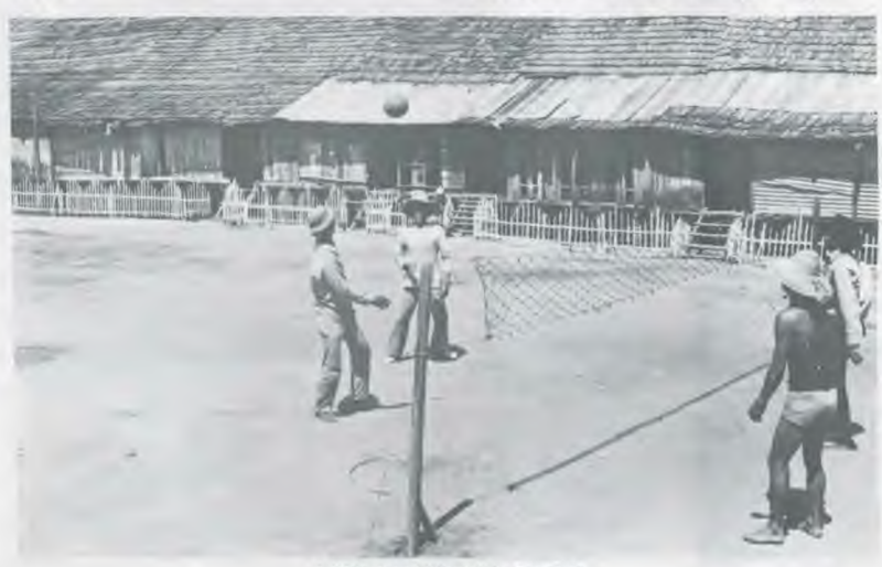
A "Modern Village" in Sarawak.

Any village that qualifies by meeting these ten points is awarded a beautiful "Modern Village" sign.