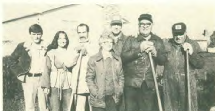
St. John members use Thanksgiving Day to minister ingathering contact.

On Monday morning, Thanksgiving Day, ten of our Saint John church members worked at this home cleaning the house inside and out. After I had taken the enclosed picture I made it a point to meet the couple of the house. I was graciously received by the lady who sincerely expressed her deep appreciation for what "your members" were doing for them. And then she invited me into a den and, in spite of my objections, proceeded to write a cheque for "your church" to the amount of $50.00.