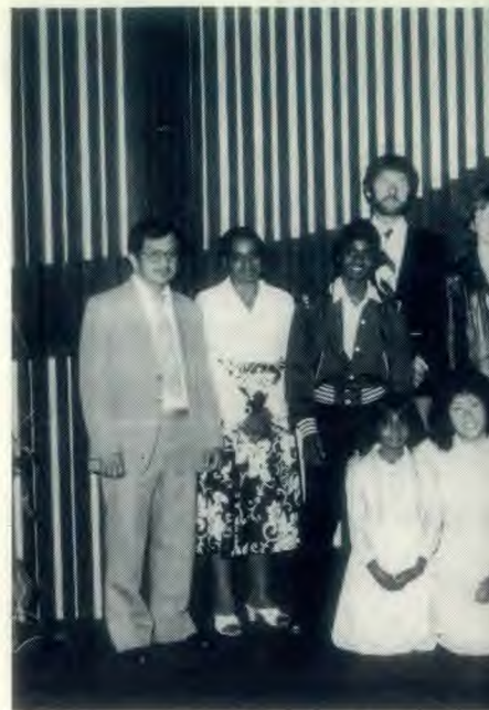
Fifteen of the 24 persons baptized in Vancouver.