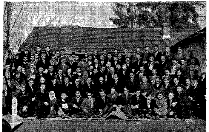
Lay Preachers' Institute in Craiova, Rumania.

with the same heavy fine and his civil rights also withdrawn. The three sisters were imprisoned for three months, with heavy fines. The reason for the punishment was that they belonged to the Adventist church and were carrying on sectarian propaganda (lay preaching).