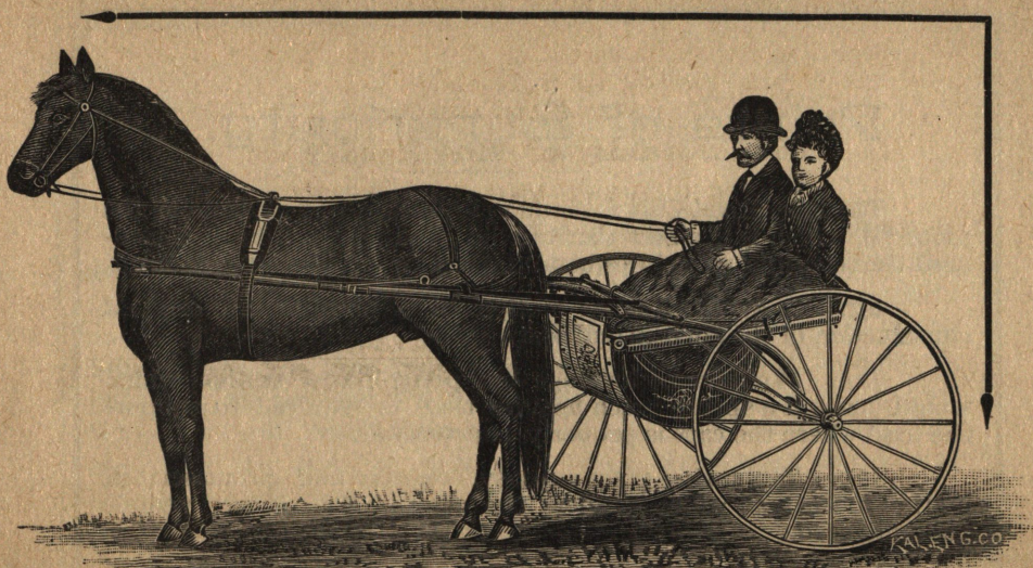
No. 2.—A TWO PASSENGER CART, WITH SLAT FOOT REST, No. 2½.—A TWO PASSENGER, WITH BODY