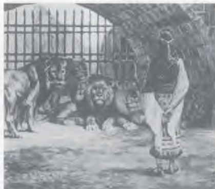
Here is one of the earliest examples of the battle for human dignity and freedom against a faceless power structure.

The little Jewish state of Judah was already meshed between the monstrous and impersonal cogs of Persia's towering bureaucracy. A glimpse of the inhuman ways those wheels turned is given us in the famous Bible story of Daniel in the lions' den. (Daniel 6.) The prophet was put there because his ways of worshipping God violated the unjust decrees of the State; so, because "the laws of the Medes and Persians could not be altered," Daniel was thrown to the lions.