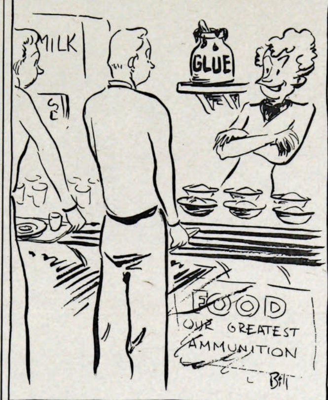
"So you guys wanted food that would stick to your ribs—okey, -you got it!"

Published bi-weekly by the Associated Student Body of a College during the school year except holidays, registration ds, and examination weeks. Also published once during