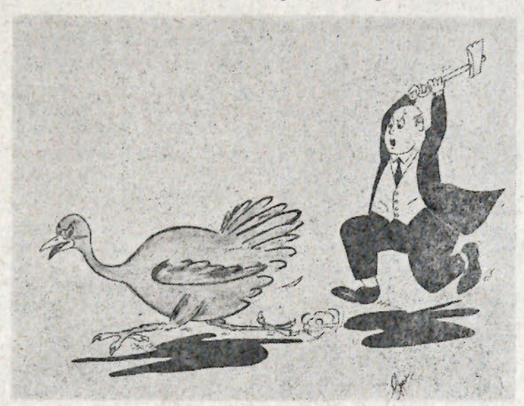
And what's wrong with a vegeloaf for Thanksgiving!

Let's not be satisfied with mediocrity. You aren't average, so why should your image be?