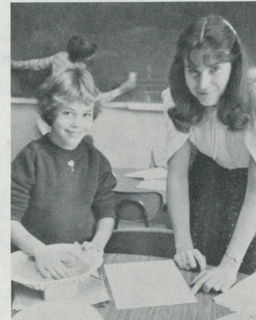
Students find it fun to study in the Learning Advancement Program.

the program are identified by the regular classroom teacher, by parents or by the students themselves. Extensive professional testing is done with parental consent to identify the extent of the exceptionality and to outline an Individualized Educational Plan which can enhance the student's learning potential. Extensive evaluation is conducted continually to determine progress and future goals.