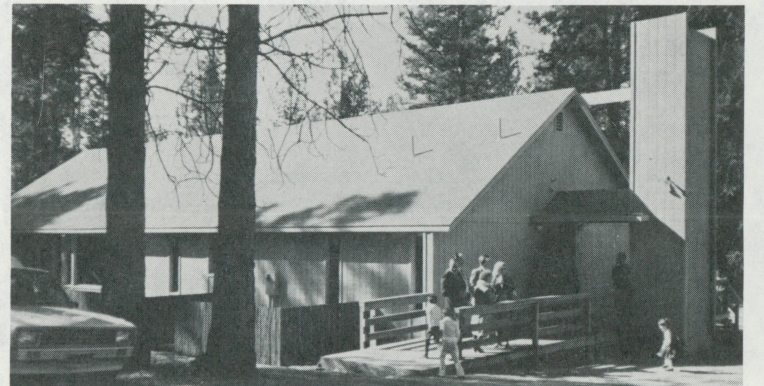
Open House was held at the new West Point church on February 4.

community. State it's members, "It is hoped that this building will become more than a building used once a week but rather a spiritual and educational center focusing on health, nutrition, stress management and positive family life, as well as Bible-centered day-to-day spiritual growth."