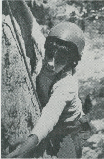
A participant in Reach Unlimited struggles toward achievement.