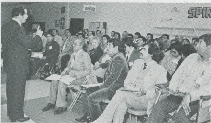
Class on the Holy Spirit even forfeited recreation time for extra sessions at the Hispanic Lay Congress.