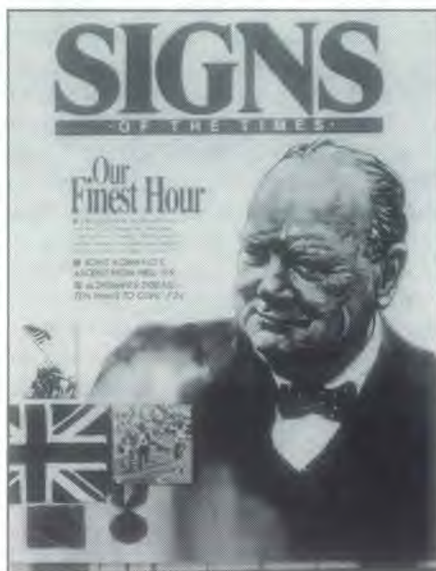
Signs of the Times and AIM join forces for a 20th century method of effectively communicating the gospel. An 800 number is listed in each issue of Signs .

And this combined outreach is working. Since 1983, when Signs began carrying the AIM number, more than 1,000 people a year have