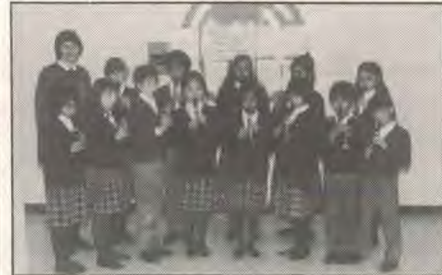
Grade 5 Recorder Choir