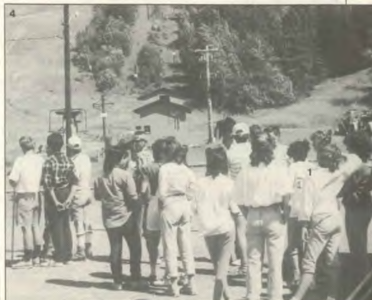
4 Sandy Lake Academy students prepare for the great outdoors.