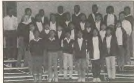
Grade 4 Elementary Choir