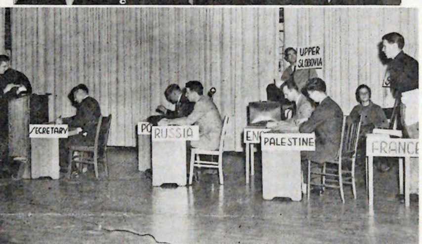
SCENES ON CAMPAIGN OPENING DAY

Upper: Coys' leaders and assistant leaders Lower: Martins' United Nations skit