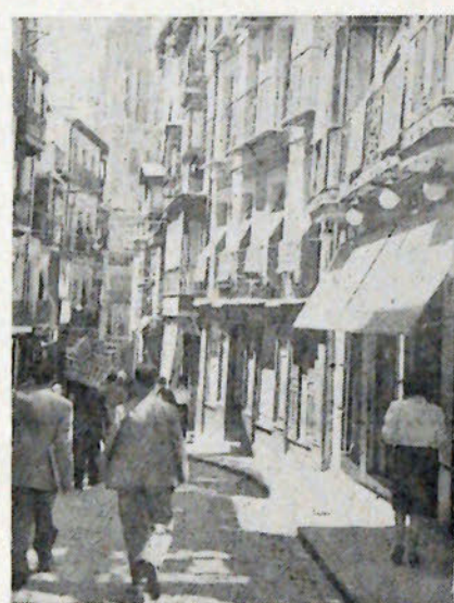
Street Scene in Toledo

By the end of June I had all my information gathered and plans laid for the circle trip which for two months kept me traveling almost day and night and led me through Normandy and Brittany, down the west coast of France, across the Spanish border to Madrid, Toledo, and Barcelona, across southern France and into Italy, back into France long enough to attend the Southern European Division Youth's Congress, into Switzerland for a most delightful week, then through Belgium and Holland to England and Scotland. I wanted to see and hear and learn all I possibly could, and three months is such a little time to do it in. So I kept my eyes and ears wide open as I chatted with people on the trains, in the streets, on park benches, in their homes. I talked to Spanish priests and nuns, to French men and women who had been associated with the underground, with Italian prisoners of war, with Swiss citizens on holiday (we call it vacation) after spending years in North Africa, with a Belgian who like many others had hid for months during the war to avoid deportation to Germany for forced labor, to Dutch business men, to Londoners who had passed through the blitz, to kilted Scotsmen with their delightful brogue, to gentle English folk who find peace and comfort beside their lovely lakes.