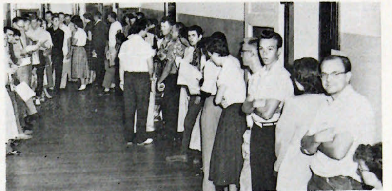
Lines of students, resignedly waiting, wind through the Administration building as Union College opens its doors to a five-year record enrollment.