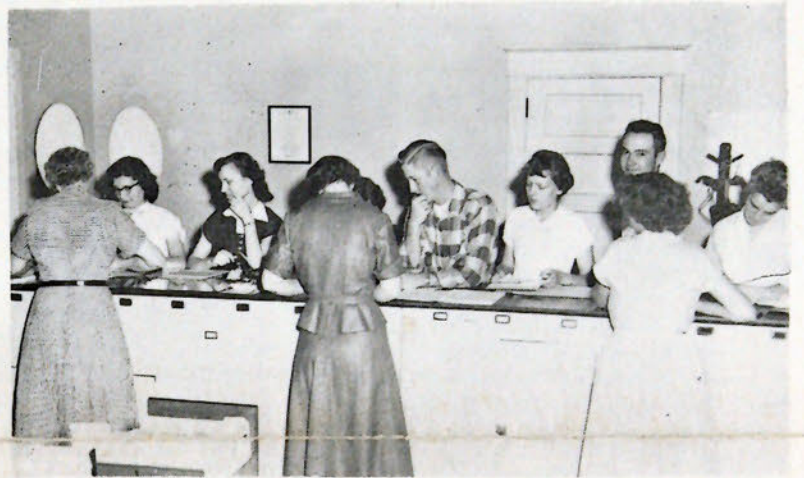
Station 3 in the Registrar's office is busy as students get instructions on courses.