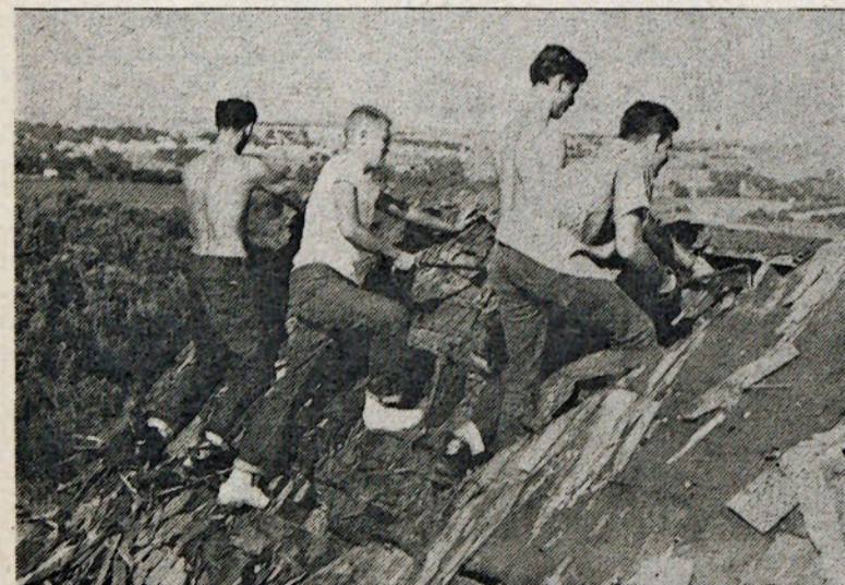
Vet Retires—After more than 80 years of service North Hall is going into retirement. Shown are four student workers as they start to tear part of the roof apart.

A Pessimist: A person who thinks shoes will cost 100 rubles by 1970.