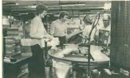
Covers for the paperback edition are applied at the rate of 3000 per hour on the mini-binder. The 1000 Days of Reaping edition will be entitled Cosmic Conflict .