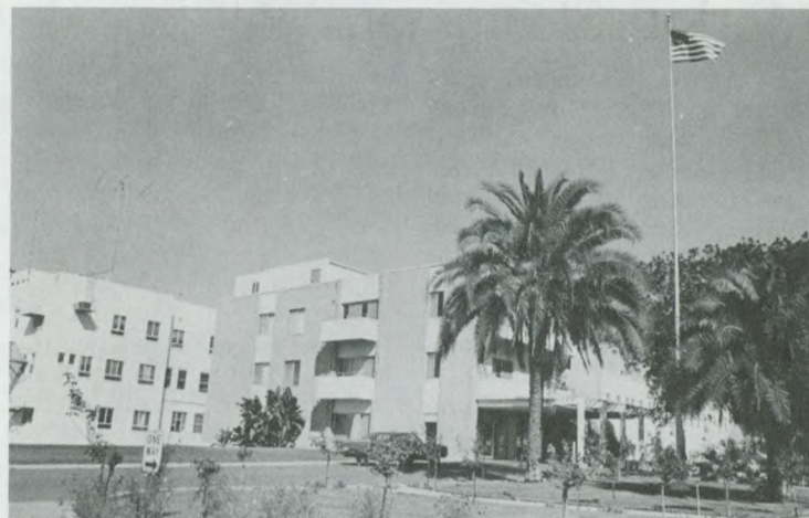
An offering to be taken December 15 will help Paradise Valley Manor's expansion program.

To relieve pressure on the hospital staff and hopefully to