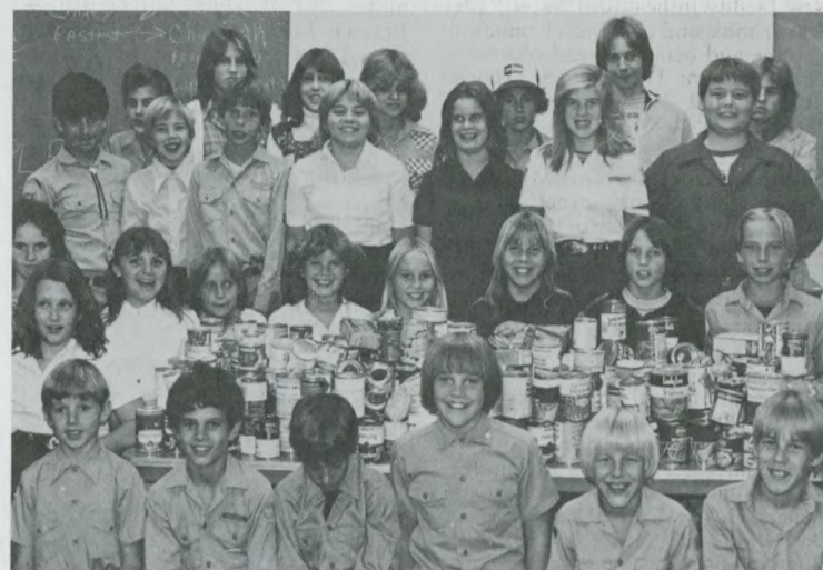
Young members of the Tempe Pathfinder Club count the abundant supply of canned goods they collected on Halloween.