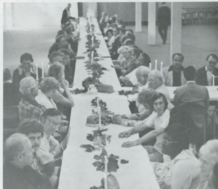
Workers in Northern assemble at a large table in the shape of a cross to partake of a communion service at the workers' meeting.

Plan to come and invite a friend. The public is also invited. A freewill offering will be taken. Recordings will be available following the concert.