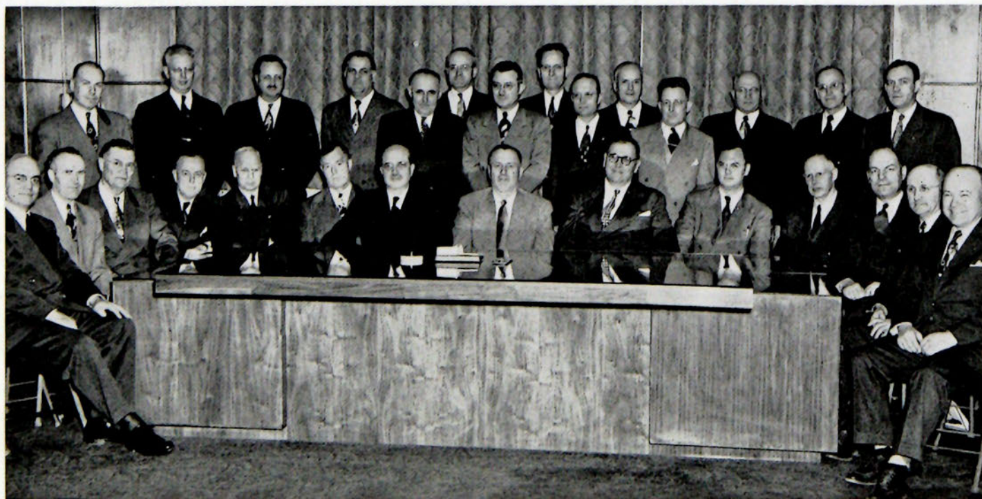
Union College Board of Trustees