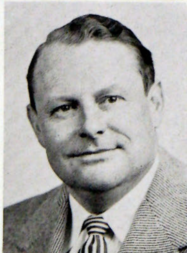
H. A. Kaufman Dairy