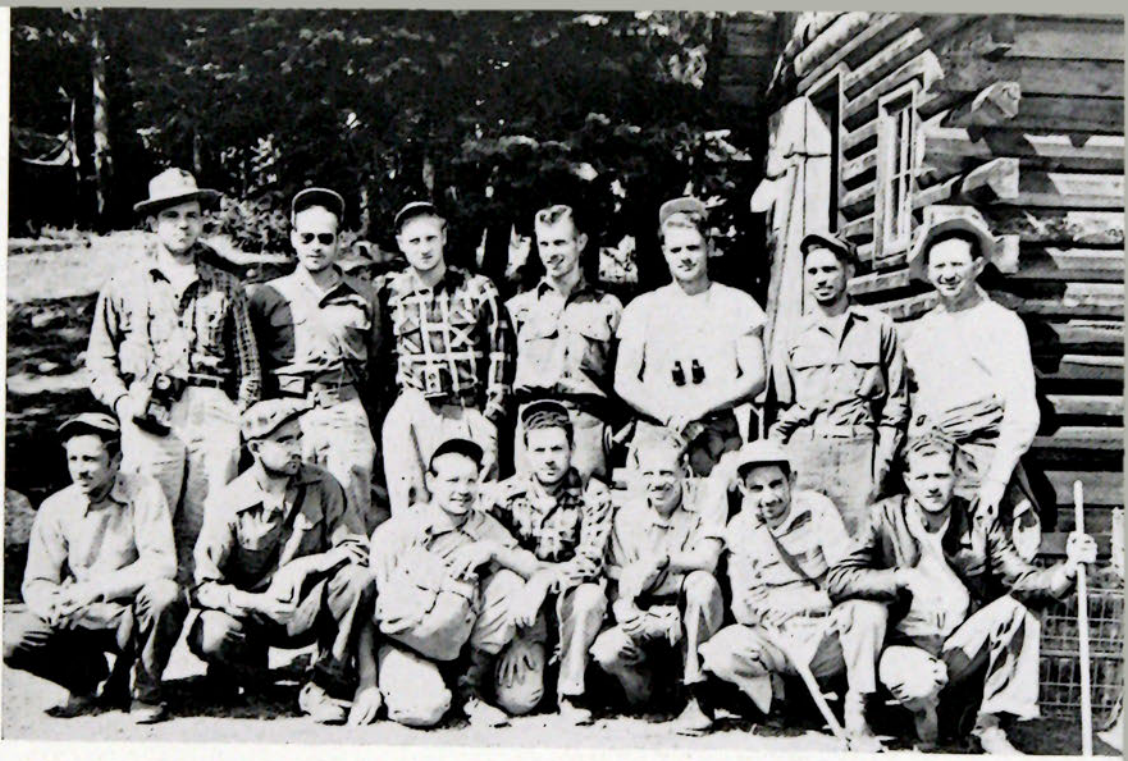
Every year in August the Biology department of Union College has a summer camp in the Rocky Mountains. Pictured above you have some of the fellows that attended the camp two years ago. The female of the species also attends although they are not pictured here. The group studies wild life and other biological subjects.