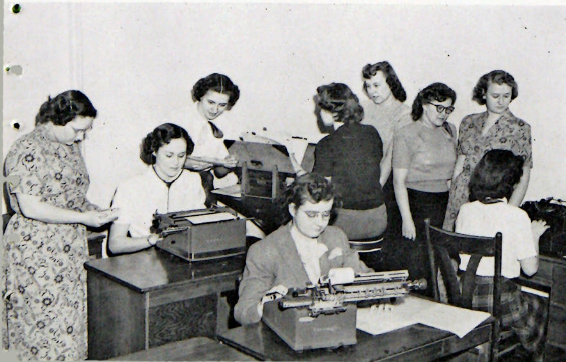
Below, the secretarial majors are busily practicing on the business machines in their laboratory. With the demand for secretaries at an all time high this department is very popular.