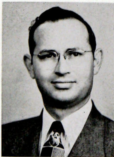
J. C. Turner Farm