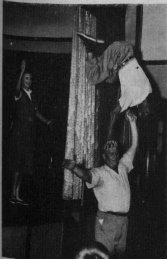
The Trio exemplifies its art