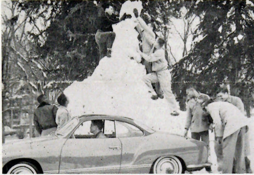
When the boys "rolled up the campus," Ghia in galoshes stood by.

Approved with the new constitution was a measure providing for the continuation of the present system until such time as the congress will change them.