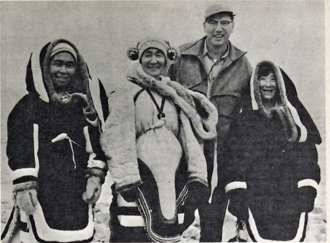
Cooper poses with three Eskimo Dancing Ladies who will appear in his current film "Canadian Holiday."

The student council is the legislative body of the students made up of three elected members from each class, five from