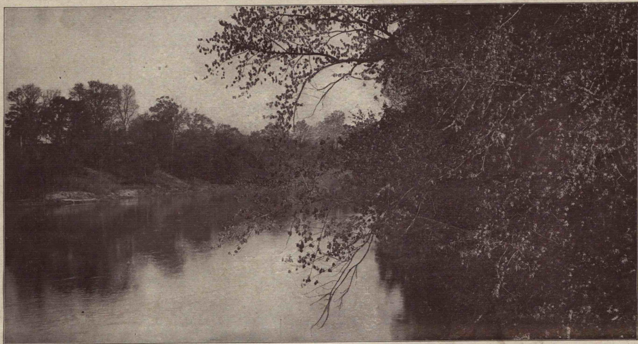
A GLIMPSE OF THE ST. JOSEPH RIVER, ON WHOSE BANKS THE SUMMER SCHOOL WILL BE CONDUCTED