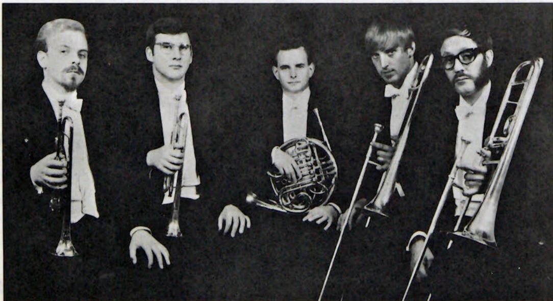
The London Gabrieli Brass Ensemble, on their first American tour, formed the group to bridge the gap between pop and classical music.