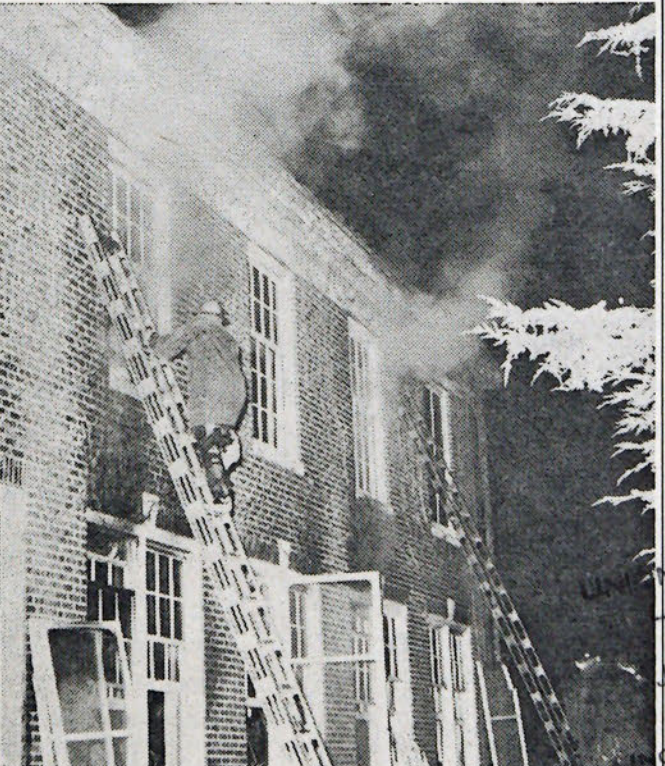
Students returned from Christmas vacation January 3 to see smoke and steam pouring from Engel Hall. The blaze caused an redecorated before it is reopened smoke and steam pouring for classes, according to Dr. Hill. estimated $10,000 damage.