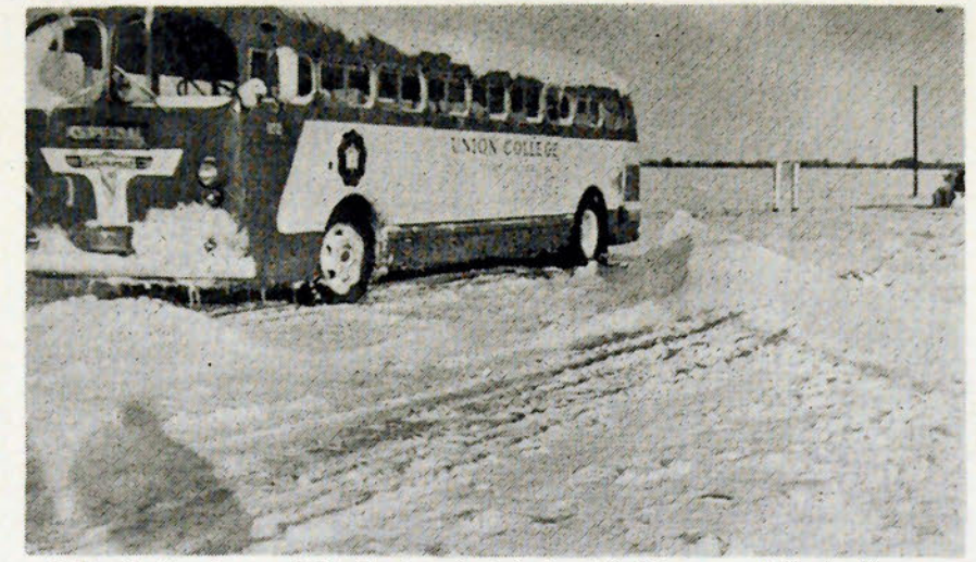
Union College bus and Mexico-bound students stalled in snow drifts in Kansas

If we had no faults our lves, we should not take so much plea-