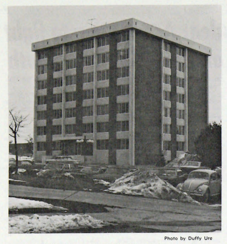
Prescott Hall is name designated for the men's hi-rise dormitory.