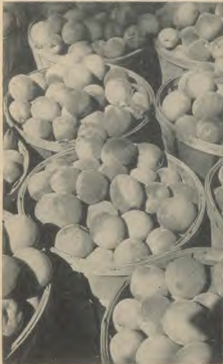
H. M. LAMBERT

Fruits can be depended upon as an excellent source of life-giving vitamins and minerals.