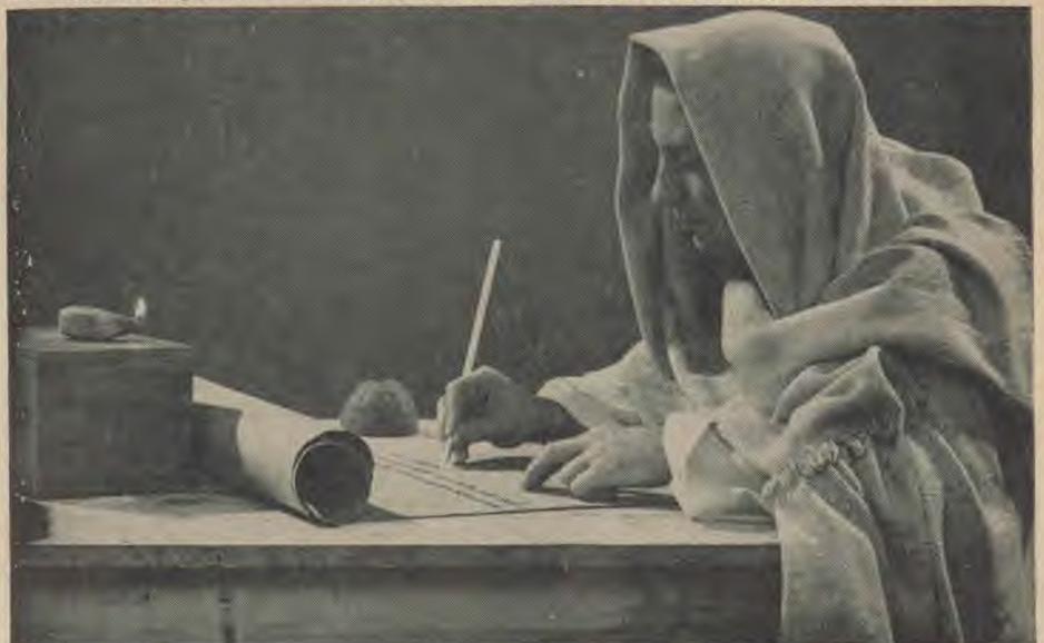
REVIEW AND HERALD

Inspired prophets wrote of things they did not understand. Among other things they portrayed the second coming of Jesus in the glory of the angels, in His Father's glory, and in His own glory.