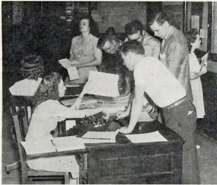
Halls are utilized to handle record registration

The largest enrollment for a first semester at Union College has reached the 931 mark as students, fresh from summer vacations, begin their first week of classes.