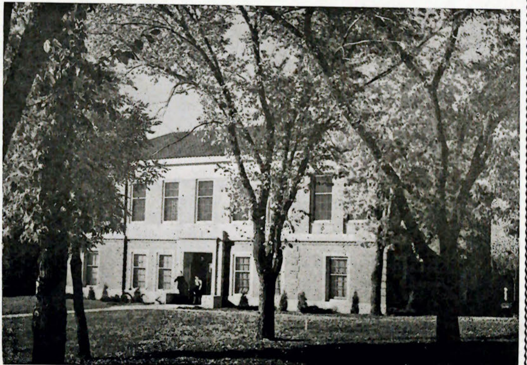
Union College Library