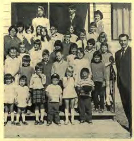
Sabbath School in Yellowknife