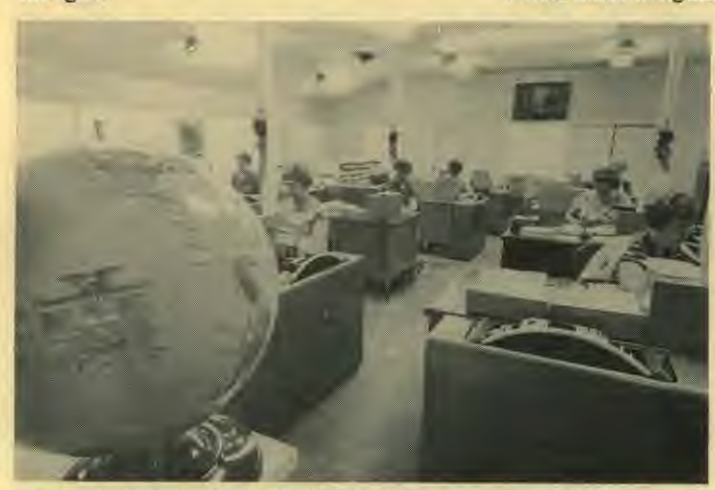
BIBLE LESSONS BY THE THOUSANDS — more than 70,000 per month — are graded in the Voice of Prophecy's 17 different Bible correspondence schools. Nearly a quarter million students are on the "active" circular files in this main section of the several schools. Each month between 1,200 and 2,000 students are awarded diplomas upon completion of the truth-filled courses of study.

Midway through your last visit the chimes ring, ending the work day. But you know a number of the workers will ignore the signal staying at their tasks