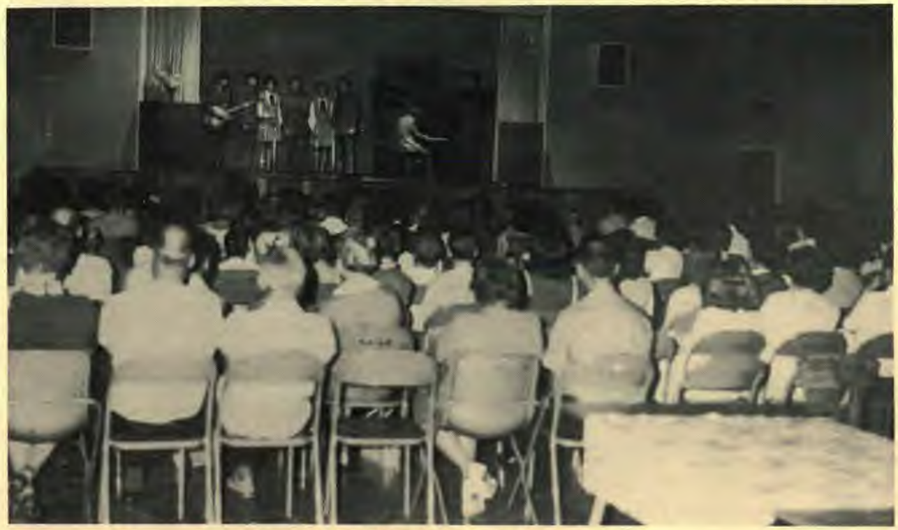
Prince George mini Camp Meeting held July 31 and August 1.