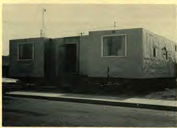
Tarangle and Associates' portable clinic in Yellowknife.