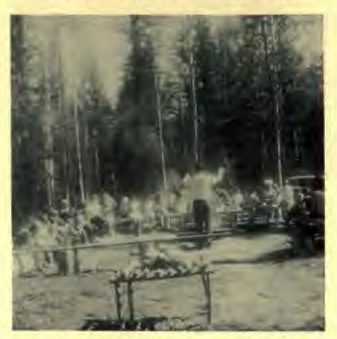
Sabbath School on the campground.

Well, we've done it again! We have conducted camp for thirty-four boys and girls of the Golden area. (Actually, they came from all around, Blaeberry, Golden, Nicholson, Parson, Revelstoke, and Malakwa.)