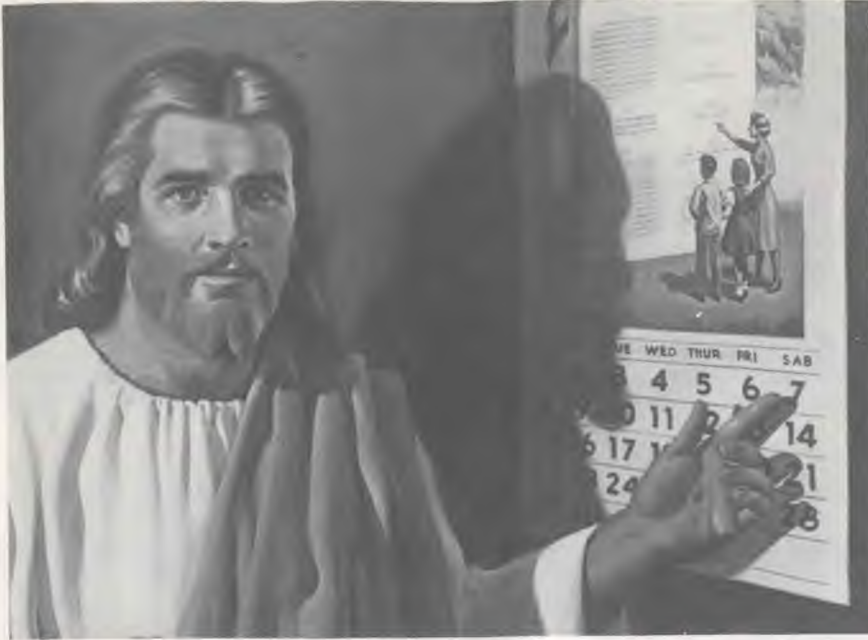
Astronomy provides the reason for observing the periods of the day, the month, and the year. But the period of the week with its concluding seventh-day Sabbath, has its origin exclusively in the Bible record of Creation—eternally enshrined in the Fourth Commandment of God's Moral Law (Exodus 20:8-11).

much information about the world about them in order quickly to adjust themselves to it. Instead of leaving them to discover everything by slow, experimental methods, their Maker came to aid them in acquiring the necessary knowledge to make their lives more meaningful.