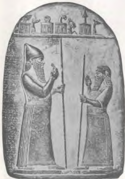
King Hammurabi of the first Babylonian Kingdom. (c. 1792-1750 B.C.) is here depicted on the famous stele on which is inscribed the laws he is here seen receiving from the so-called sun-god. This legal code is the most important single document relating to Babylonian life that is known to us.

Re-emphasized through Moses at Sinai was the Moral Law of the Ten Commandments, written by God, the real Law-giver, whose basic attribute is love. Only this was placed in the Ark of the Covenant, beneath the Mercy Seat. True loyalty to God will lead us to keep His commandments (Exodus 20:3-17), and thereby fully to respect and honour the rights of our fellow men. ↔