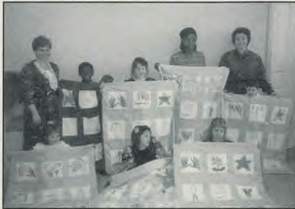
The kindergarten class of the Airport Drive church with their teachers as they display the quilts the children made.

A 13th Sabbath program was particularly enjoyable. The kindergarten class, under the supervision