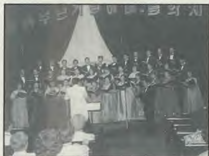
The New York Korean Church Choir and other outstanding musicians were featured during the anniversary afternoon.

means of transportation and pray for a generous blessing for the person or persons who so considerately gave to assist with the work of the church.