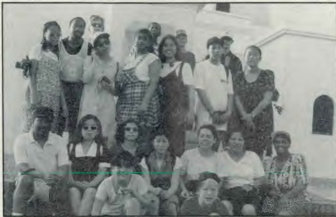
The tired travelers pause in the square at Old San Juan, Puerto Rico.

In late May, a total of 21 excited travelers set off for five non-stop days. The eager eighth-graders learned of Puerto Rico's history from visits to El Morro, the Ponce Art Museum, and a sugar cane plantation. They saw God's handiwork in the caves at Camuy, the phosphorescent fish at La Parguera, and beautiful Luquillo Beach. They enjoyed the gracious hospitality of Antillian College.