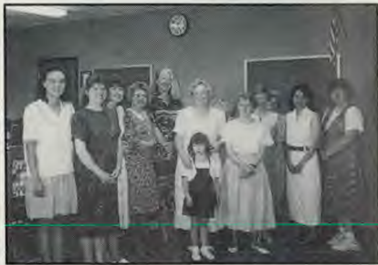
Fellowship time for the Shepherdess Club.

us of the urgency of lifting the cross before everyone we meet. The constituents of New York praised God for the special blessings received at Camp Meeting '95.