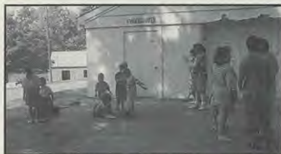
For the kindergarten-age group the doors never open early enough.

God blessed in a mighty way. The encampment spirit was excellent. There were no serious accidents or problems. We look forward to June 15–22, 1996, for our next camp meeting. We would prefer to hold our 1996 camp meeting in Heaven; but, if we are still here, we will celebrate again here at our South Lancaster campgrounds. Please mark your calendar and plan to be with us for this spiritual feast in 1996.