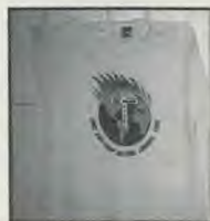
Junior Department t-shirt project.