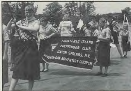
Pathfinders prepare to march.