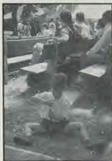
This young camp meeting attendee begins his eventually elaborate construction of earth, stones, grass, leaves and sticks that made the "adult" service pass quickly.