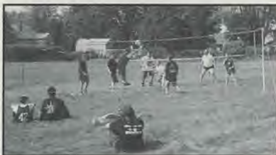
The energy of young camp meeting attendees was used in a between-the-meeting supervised volleyball game.