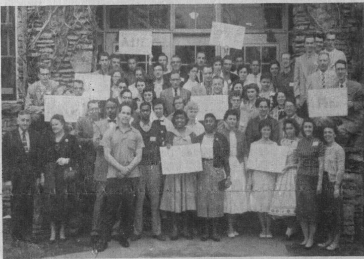
The delegates from eight colleges who met at Madison for the Eighth Intercollegiate Workshop.