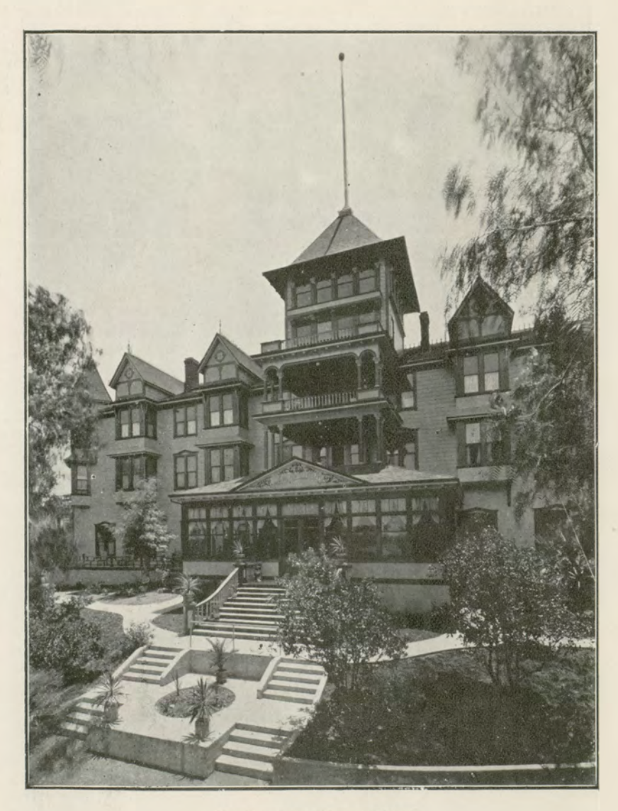
Sanitarium, Front View.