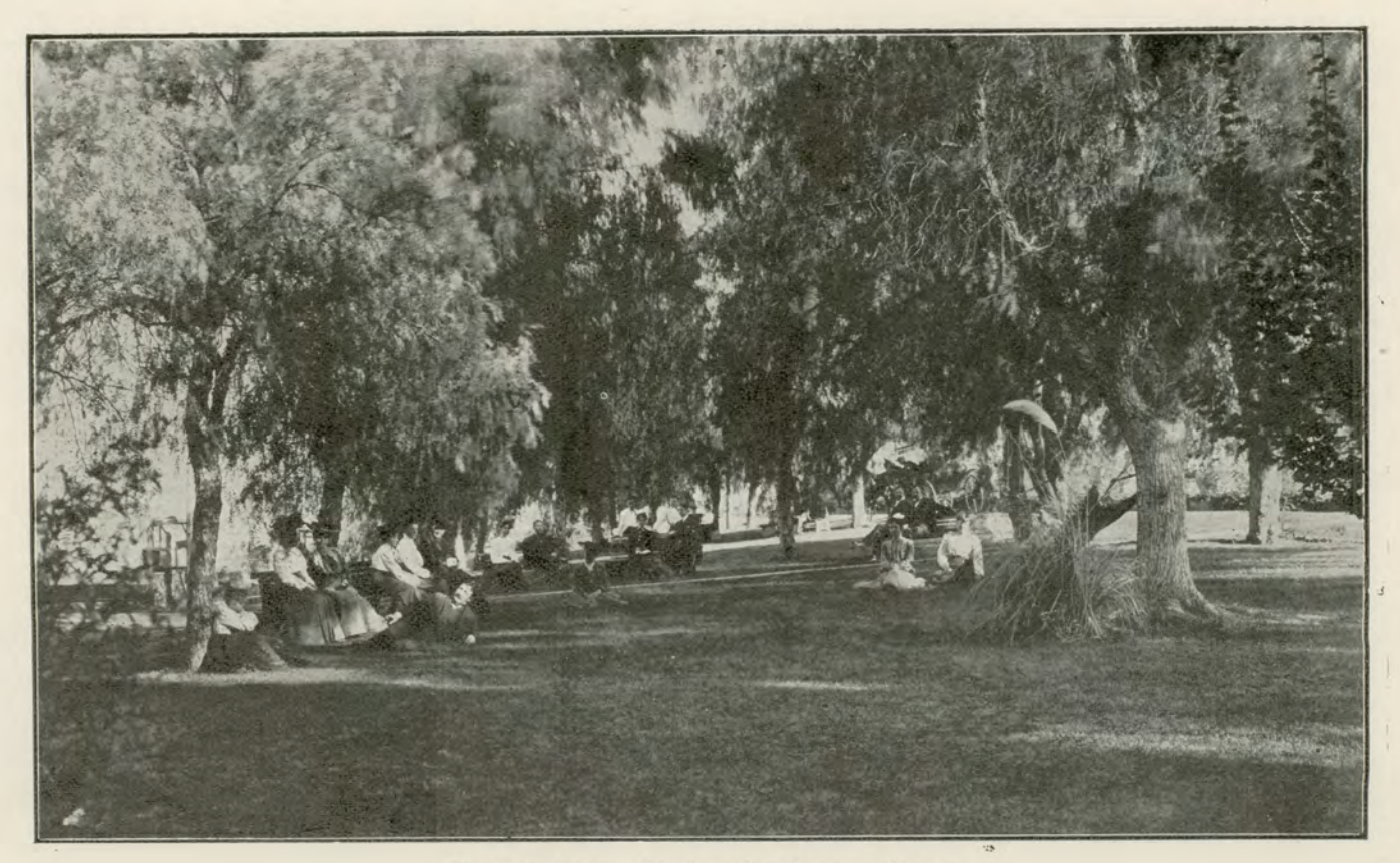
On the Lawn, Under the Pepper Trees.