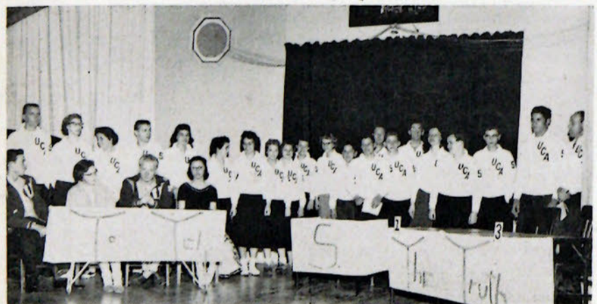
Sophomore class members pose with panel members of the 'To Tell the Truth' program which featured coming out exercises of the group.