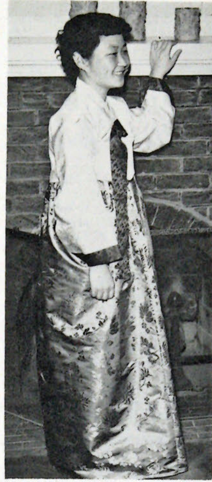
States, Union College, and four years of study.