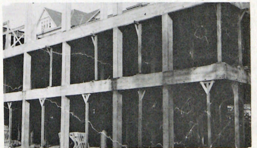
Old North Hall peeps over as the framing of new Pearl L. Rees Hall rapidly rises to cover its weather-beaten face.

Construction of Pearl L. Rees Hall is running according to or ahead of schedule, revealed V. S. Dunn, business manager, this week. The concrete framing work is three-fourths done and will be completed before the scheduled finishing date which is June 1.