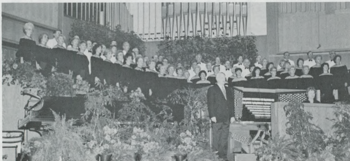
THE JOHN T. HAMILTON CHORALE presented a concert at the January 29 Sunday evening worship of the Crystal Cathedral in Garden Grove, California. Among their concerts in England this summer will be one at Westminster Abbey. Most of the musicians are members of Adventist churches.