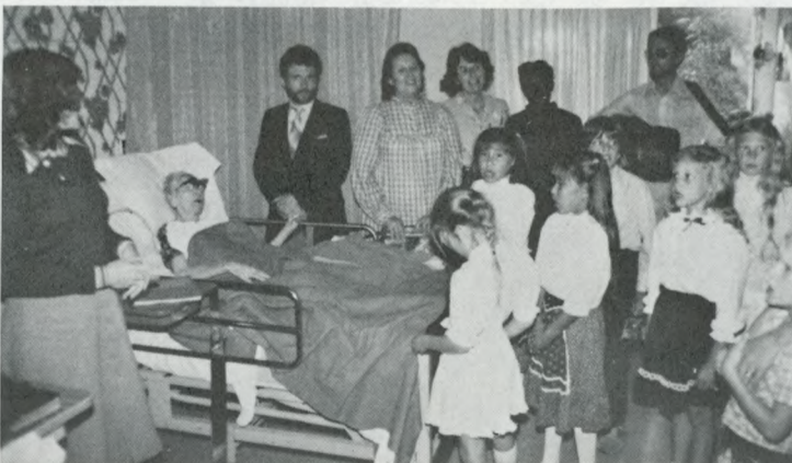
Campbell Church has organized a Kindness Ministry, and here a group of children and adults visit an elderly person in a convalescent home.

Next meeting of the club will be held at the Ceres church April 8.