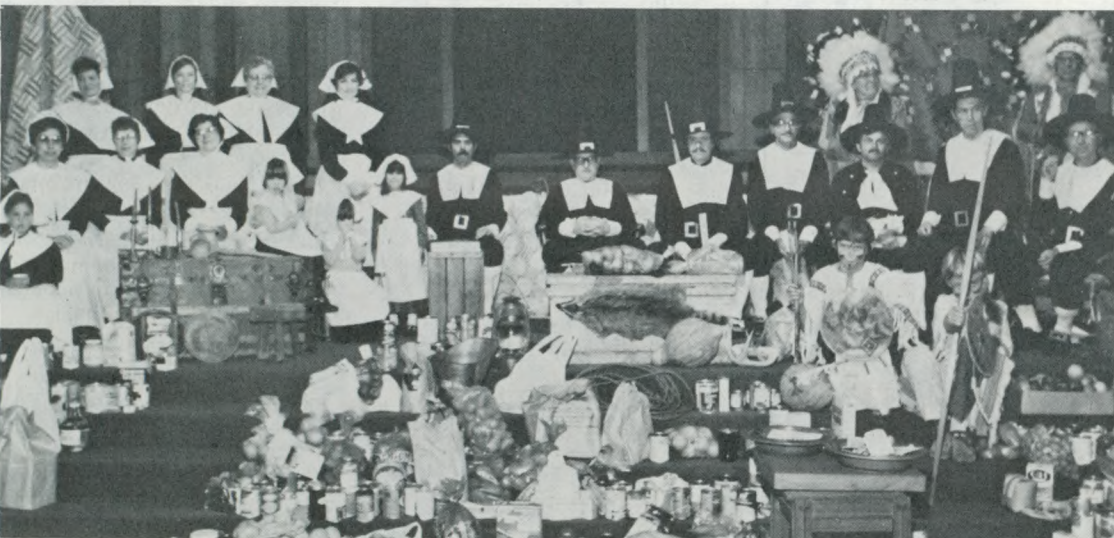
Campus Hill pastors and staff join their families dressed in pilgrim and Indian costume and surround the foods and money donated to less fortunate community members.