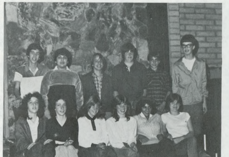
This group of Campbell Church Earliteens gathers each week to pray for the success of their evangelistic crusade.

The group's goal is to make a contribution to the 1000 Days of Reaping, but one Earliteen summed up the feelings of all in an update to the Campbell Church family recently: "The Crusade," he said, "will not be a failure if there are no baptisms from it. We just want the chance to plant a seed in someone's heart."