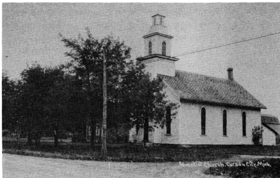
THE "LITTLE OLD CHURCH" built in 1876