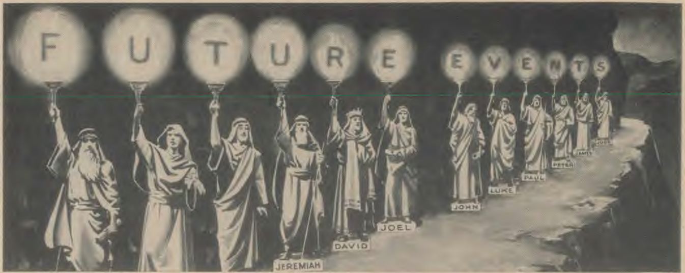
REVIEW AND HERALD

It should not be thought that divinely inspired prophecies pertain only to ancient cities. God has foretold the rise and fall of nations, as well as the fall of every nation when the kingdoms of this world become the kingdom of Christ at His coming.