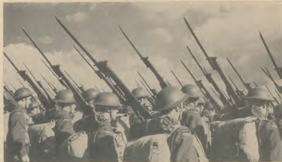
WARTIME INFORMATION BOARD

The Korean war is not the Biblical Armageddon. But certainly the nations of earth are making every preparation of armaments against that day when the east will meet the west on the plains of Megiddo.