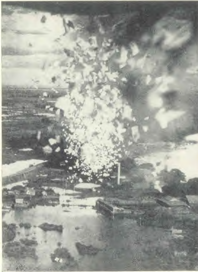
An Allied aircraft showers leaflets on a town in Burma.

Tolerance is a virtue which we do well to cultivate. But tolerance does not mean that we are to smother our convictions and keep quiet when we see tendencies that we are sure will lead to disaster. A warning is a safe sign for any community.