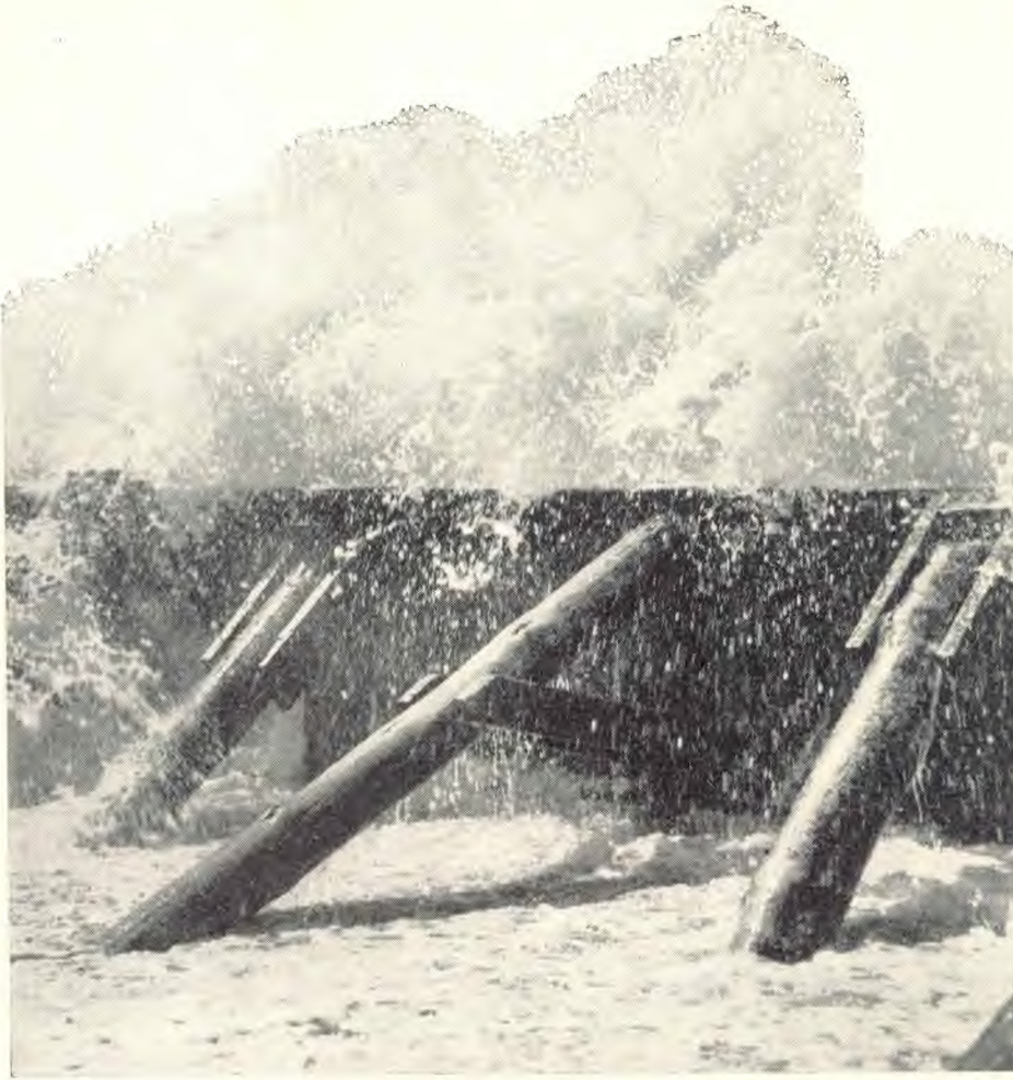
Through the centuries the waves of opposition have beat incessantly against the Sabbath truth; but it stands, braced by the Word of God.

mathematics do not change overnight. In fact, they do not change at all. The surety of these laws is what makes possible the bridging of enormous spans, the erecting of colossal buildings, the carrying to completion of apparently impossible tasks. Should one law of mathematics fail, the bridge would collapse, the building sink into ruins, the dam burst its bands. But these laws do not change. Civilization itself is built upon their continued validity. Men depend upon their unvariableness and are not disappointed. Men may fail, but God's law never.