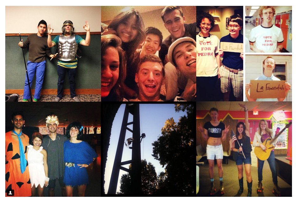
Instagrammers: L to R, top: @rudybootytooty, @carldupper4, @kerrivog; bottom: @aalas_, @ebmamead, @mailehoff93.

Instagram your favorite ASB moments with #unionunited, and your photos could appear in The Clocktower!