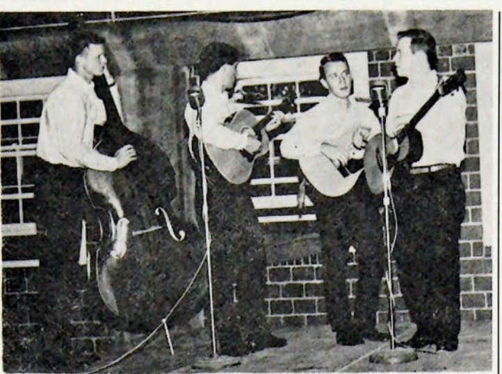
The Ember Singers decide upon their next selection before ar audience of approximately 600 people at the ASB Fall Fun Fair.

For Quality Haircuts it's the "College View Barber Shop"