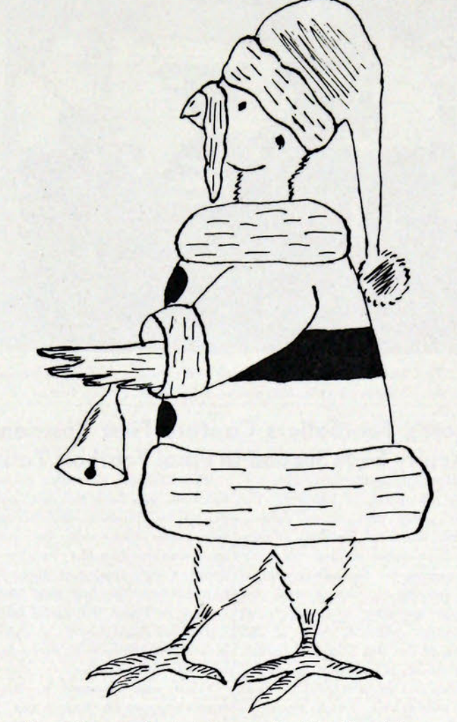
A graphic example of what your editorial staff explains as crass

Published bi-weekly by the Associated Student Body of Union College during the school year except holidays, registration periods, and examination weeks. Also published once during Iune and August.