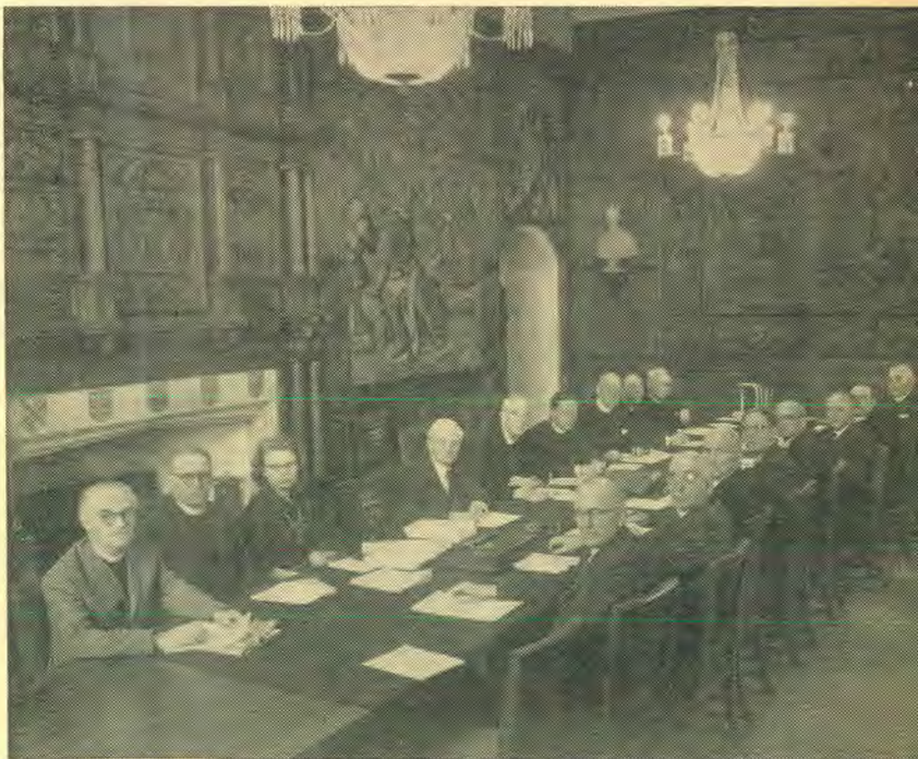
Members of the Joint Committee of the Churches in the Jerusalem Chamber of Westminster Abbey, where recently they formally approved the New Testament portion of the "New English Bible."

In this connection it is significant that at the (Continued on page 15.)