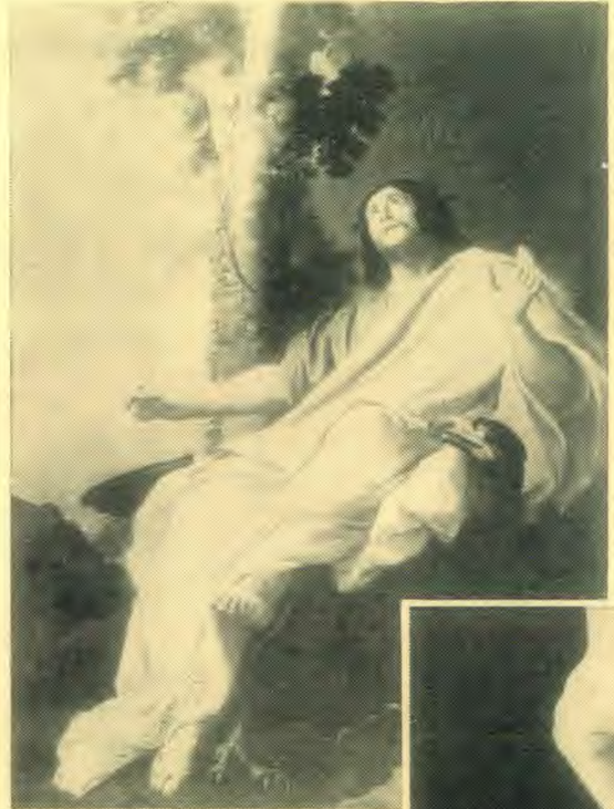
During his visit to the Isle of Jersey, John Wesley had a vision of God on the days of his life.

Luther recovered the Scriptures from the dusty shelves of monasteries and museums and from them he restored the doctrine of justification by faith. As Philip Schaff says of the Reformation of the sixteenth century: "It went, through the intervening ages of ecclesiasticism, back to the fountain-head of Christianity itself, as it came from the lips of the Son of God and His inspired apostles." — A History of the Creeds of Christendom , page 204.