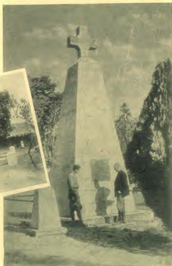
Under this monument in central Africa the heart of David Livingstone lies buried. (Inset) The spot where Livingstone and Stanley met.