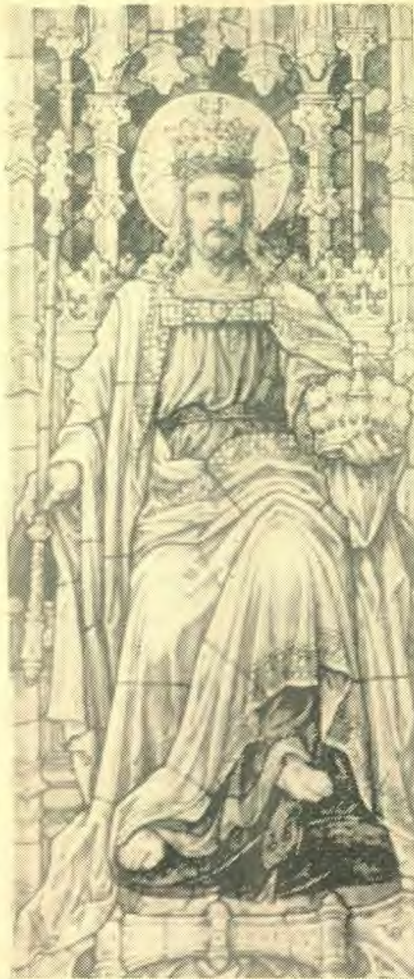
When Jesus came the first time His glory was veiled to humanity, but when He returns it will be as "King of kings and Lord of lords."

How great will that glory be! Ah! mortals have never before beheld the like. The glory of God the Father, a glory so great, so intense, so bright and vivid "that no man can approach unto" it, will be added to the equal glory which Christ Himself possesses of His own right, that glory of which He prayed, "O Father, glorify Thou Me with Thine own self with the glory which I had [shared] with Thee before the world was" (John 17:5), and all the borrowed glory of the mighty angelic throng, not one of whom will be missing